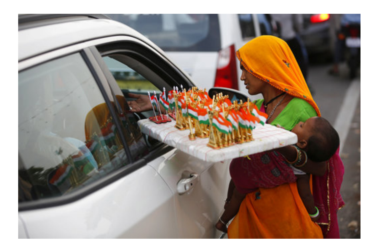
A woman sells Indian national flag memorabilia on the eve of Independence Day in Lucknow, India, Tuesday, Aug. 14, 2018.

India will send a manned flight into space by 2022, Prime Minister Narendra Modi announced Wednesday as part of India's independence day celebrations.