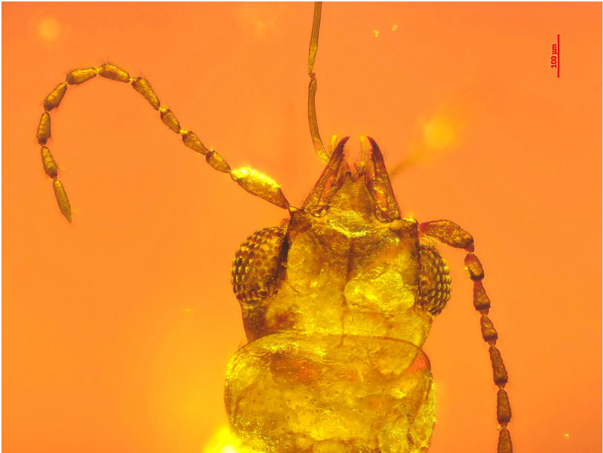
A dorsal view of the mid-Cretaceous beetle Cretoparacucujus cycadophilus , including the mandibular cavities it likely used for pollination. Credit: Chenyang Cai

The researchers also conducted an extensive phylogenetic analysis to explore the beetle's family tree. Their analysis indicates the fossilized beetle belonged to a sister group to the extant Australian Paracucujus , which pollinate the relic cycad Macrozamia riedlei . The finding, along with the current disjunct distribution of related beetle-herbivore and cycad-host pairs in South Africa and Australia, support an ancient origin of beetle pollination of cycads, the researchers say.