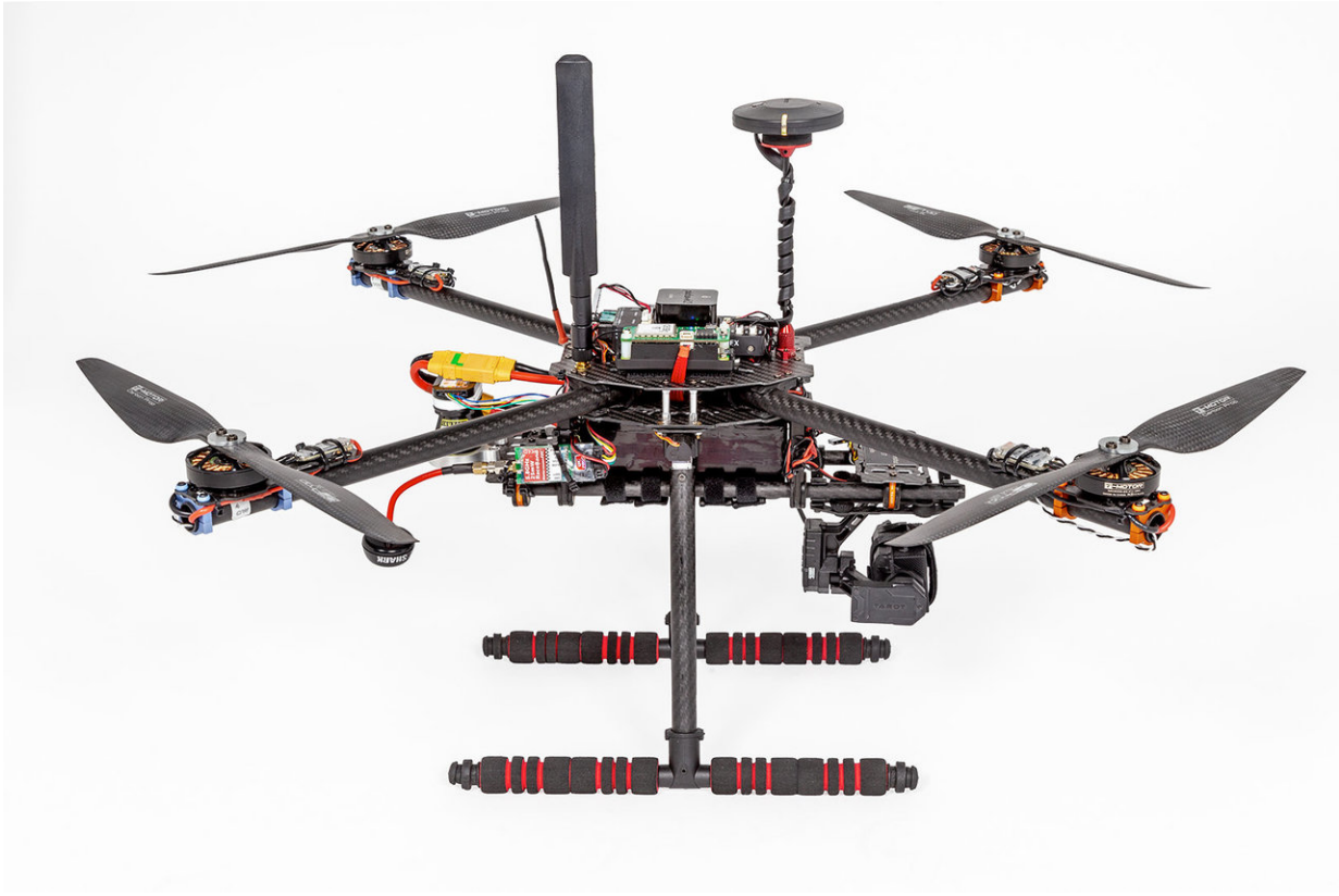
Test drone of the Fraunhofer HHI.