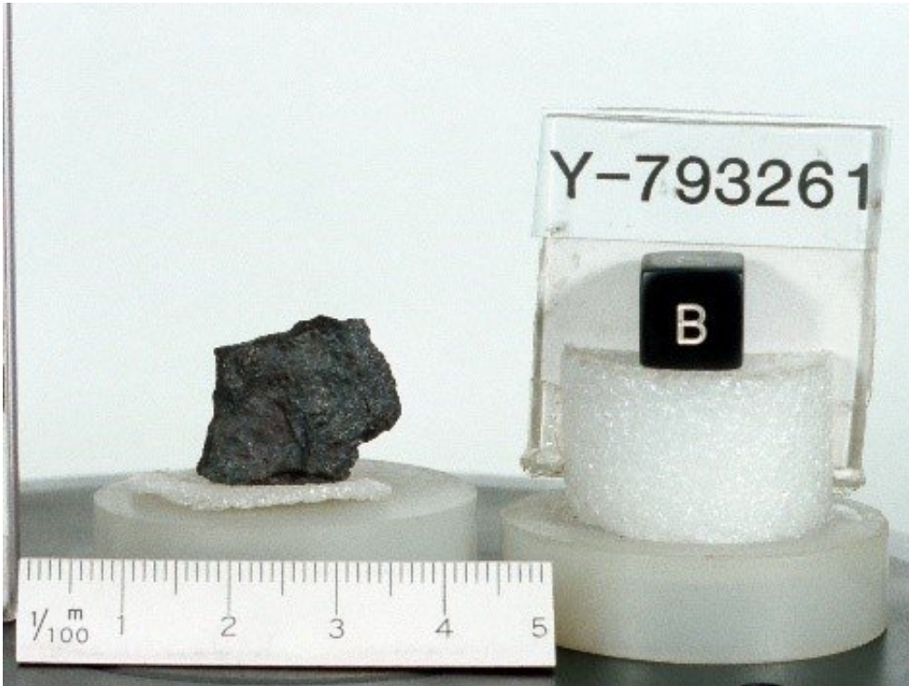
Primitive meteorite Y-793261.

They also found that the quartz in the AOA has an oxygen isotopic composition close to the sun's. This isotopic composition is typical of refractory inclusions in general, which indicates that refractory inclusions formed close to the protosun (approximately 0.1 AU, or 1/10 of the distance from the Earth to the sun). The fact that the quartz in the Y-793261 shares this isotopic composition indicates that the quartz formed in the same setting in the solar nebula. However, silica condensation from solar nebula gas is hypothetically impossible if minerals and gas remain in equilibrium during condensation. This finding serves as evidence that the AOA formed from a rapidly cooling gas. As silica-poor minerals condensed from the gas, the gas changed composition, becoming more silica-rich, until the quartz became stable and crystallized.