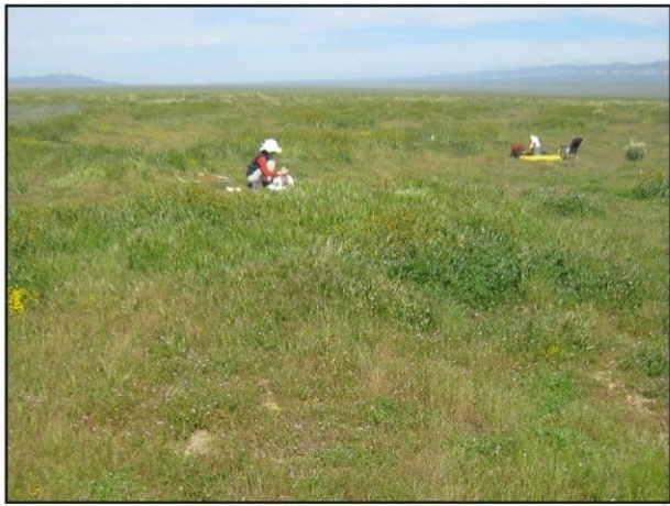
'Center Well 2' site (Mar. 30 th , 2011)