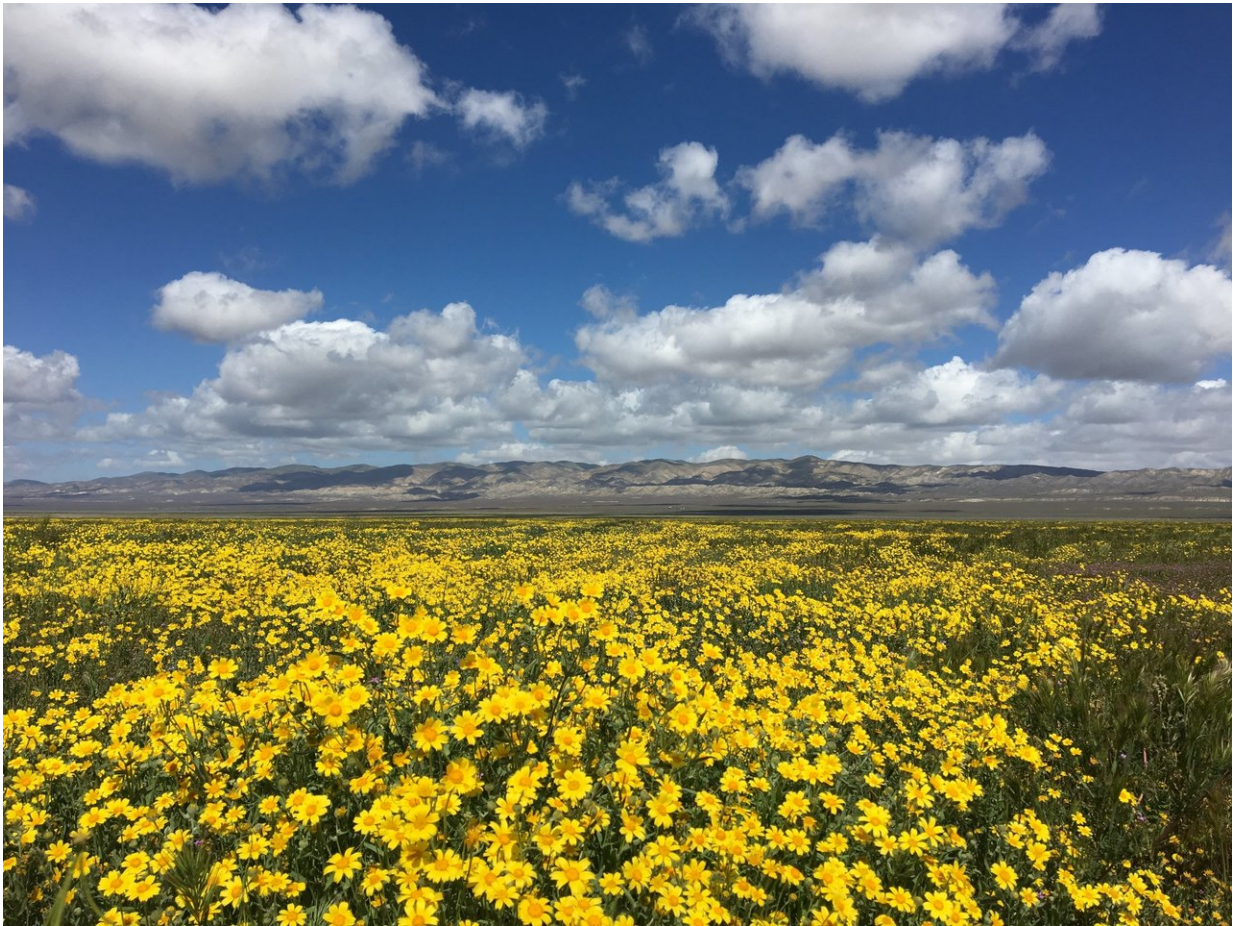
Wildflowers in bloom across the Carrizo Plain, shown in 2016.

The laborious endeavor took many forms. Researchers cordoned off random plots of land and counted plants inside each square. They dug holes and put pitfall traps to catch insects, and identified everything that fell inside over a two-week period. They set live traps to catch rodents and other small animals during the day, and different traps to catch nocturnal rodents. The volunteer-run Carrizo Plain Christmas Bird Count provided the best numbers for birds. While driving around at night, researchers shone flashlights to look for reflections off the eyes of nocturnal animals. Observers counted the numbers of pronghorn