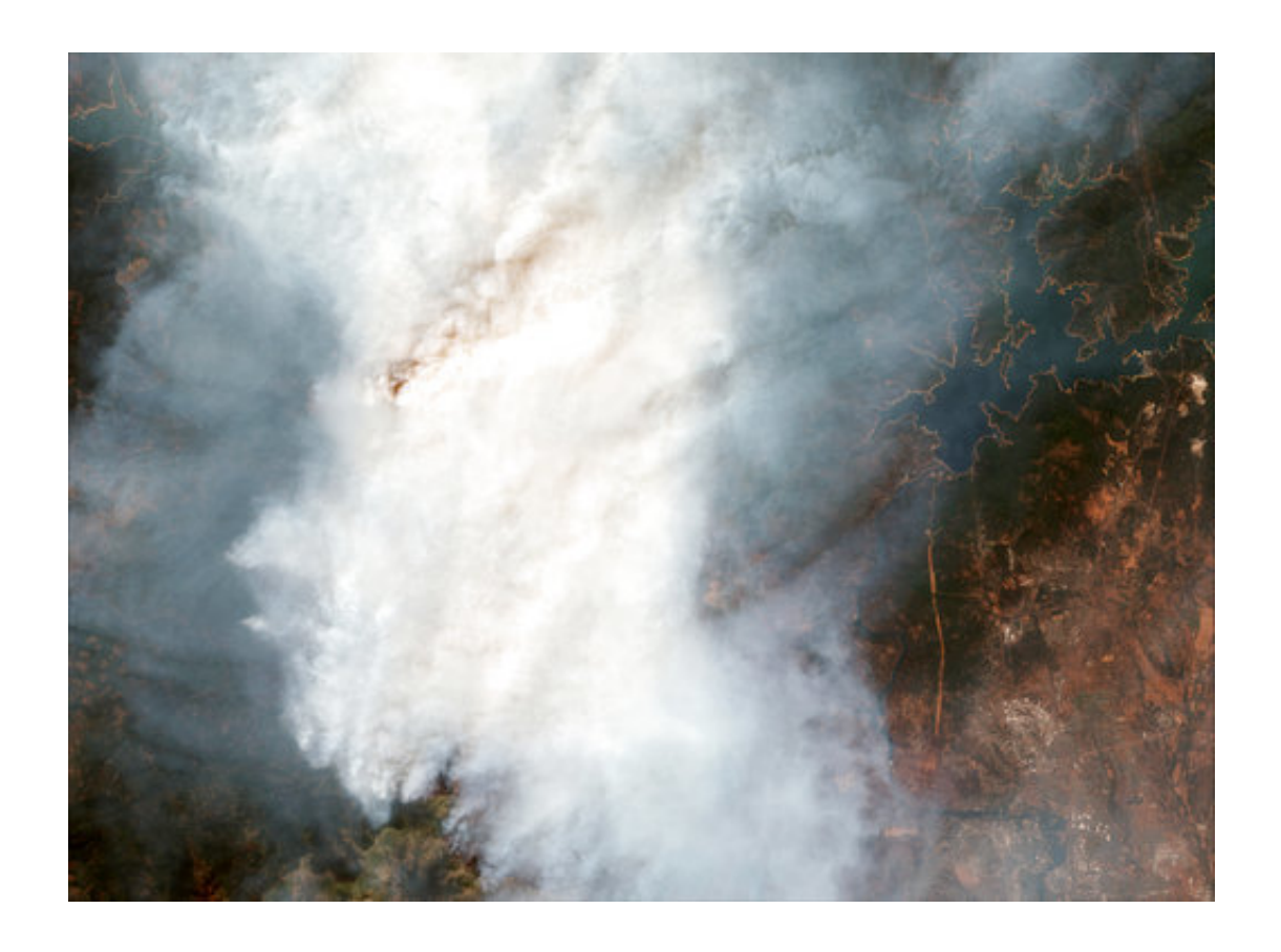
This Aug. 1, 2018, satellite image provided by DigitalGlobe shows plumes of smoke from the Carr Fire, which is burning vegetation around the area west of Shasta Lake, right, Trinity Lake, upper left, and Whiskeytown Lake, hidden at center by the plumes, near Redding, Calif., bottom right. (Satellite Image ©2018 DigitalGlobe, a Maxar company via AP)

Image ©2018 DigitalGlobe, a Maxar company, via AP)