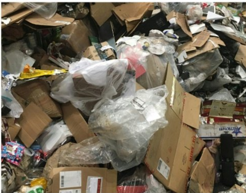
At the top, an unrecycled trash pile at the Fort Totten Transfer Station. At the