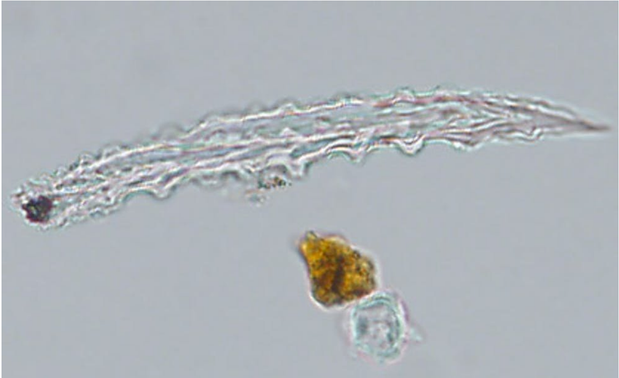
chart their appearance in ancient sediments.

Wild breadfruit phytolith.