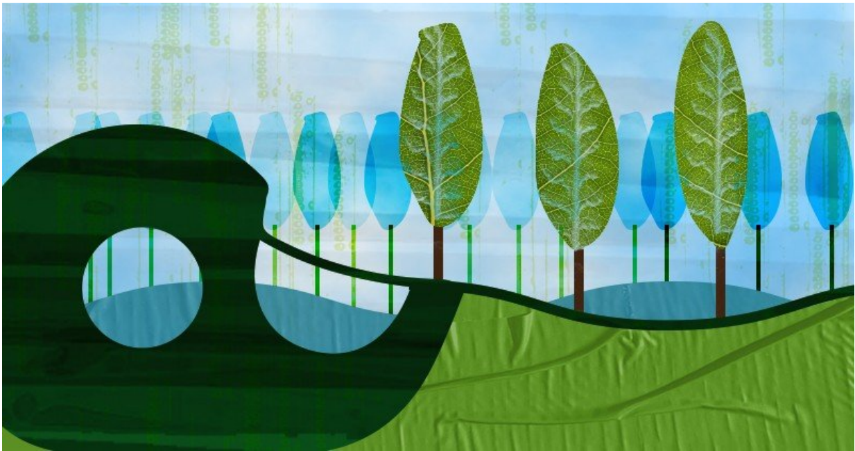
Illustration representing the transformation of trees into tape. Engineers at the University of Delaware have developed a novel process to make tape out of a major component of trees and plants called lignin.

Whether you're wrapping a gift or bandaging a wound, you rely on an adhesive to get the job done.