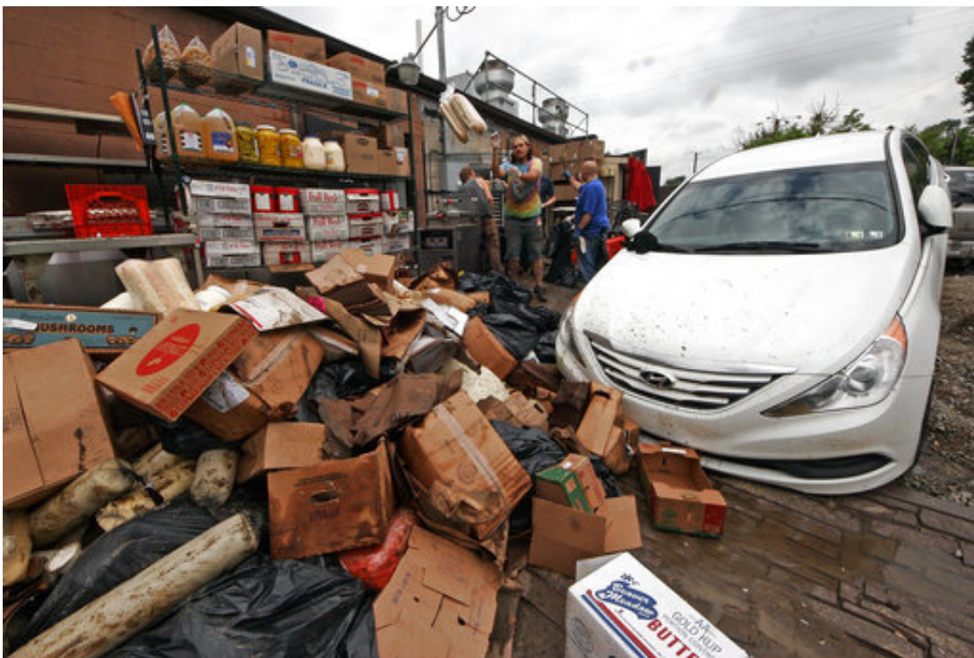
Workers clean up at the Trolley Stop Inn in Bethel Park, Pa., Thursday, June 21, 2018, after heavy rains the night before caused severe flooding.