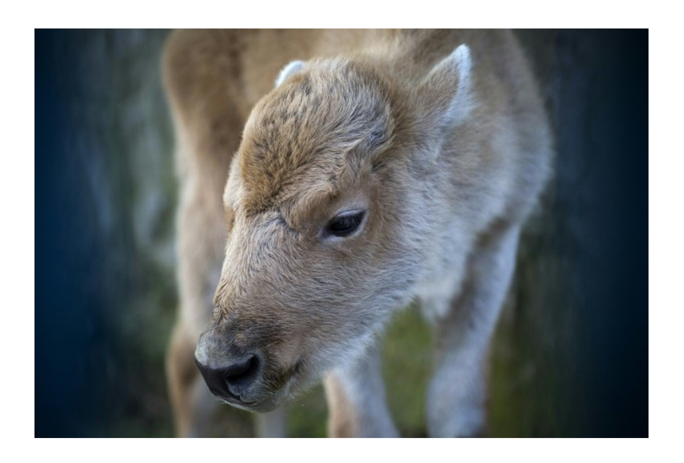
"Dusanka", an extremely rare white bison, was born at Belgrade zoo

One of the world's rarest animals—a white bison—has been born at Belgrade zoo, officials said.