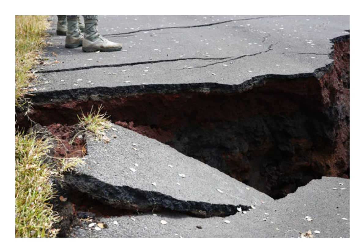
U.S. Air National Guardsmen stand near cracks on the road in the Leilani Estates subdivision near Pahoa, Hawaii Friday, May 18, 2018. Hawaii residents covered their faces with masks after a volcano menacing the Big Island for weeks exploded, sending a mixture of pulverized rock, glass and crystal into the air in its strongest eruption of sandlike ash in days.