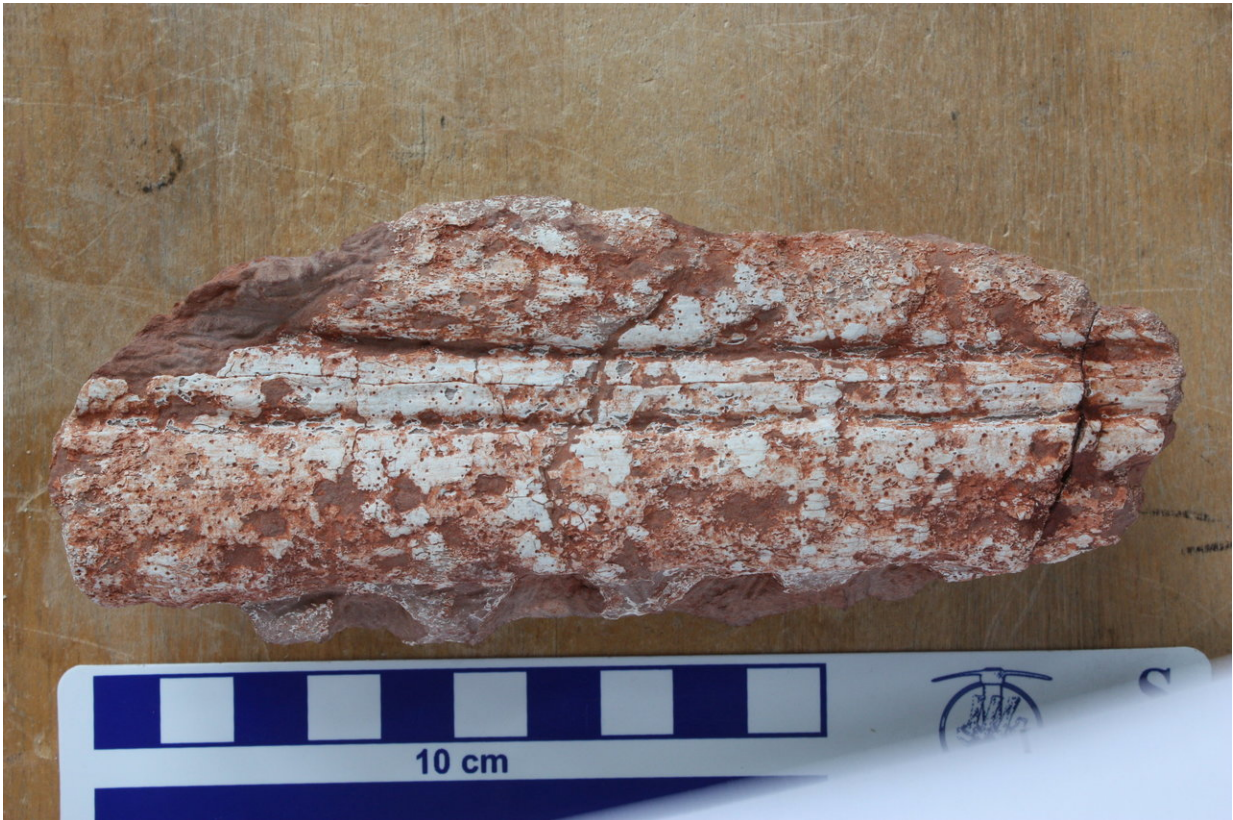
Fragment of left mandible.