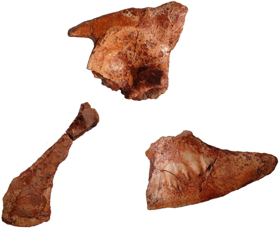
Fragments of pelvis.

It was identified as a new species based on the discovery of an odd-looking vertebra that formed part of its tail fin.