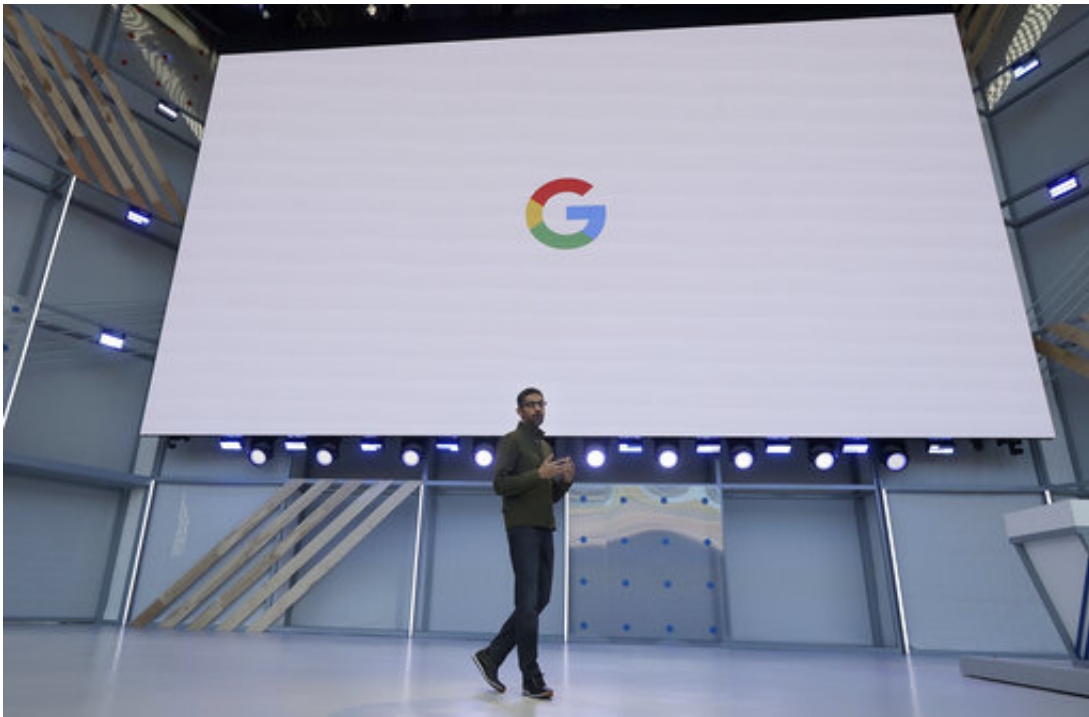
Google CEO Sundar Pichai speaks at the Google I/O conference in Mountain

LENS: Google's visual assistant will be built into the camera. Just point the camera at a building or sign to get more information. Or copy text from images of menus, documents and other sources into another app on your phone. Samsung phones aren't on the list of phones getting the feature starting next week. Samsung has its own version, Bixby Vision.