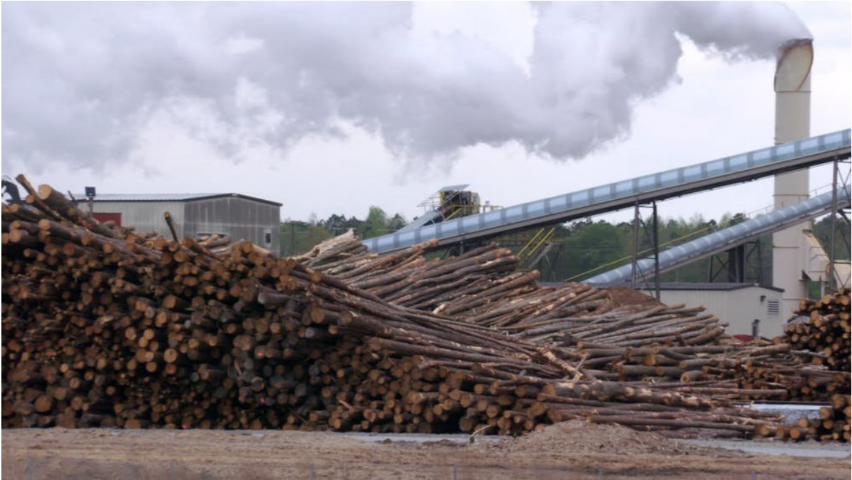
Trees at the Georgia Biomass pellet facility in Waycross.

Trees can eventually grow to replace those that were felled to produce wood pellets that are burned to produce electricity. That makes biomass very slowly renewable, if the replacement trees actually do grow enough to absorb all the carbon dioxide previously discharged.