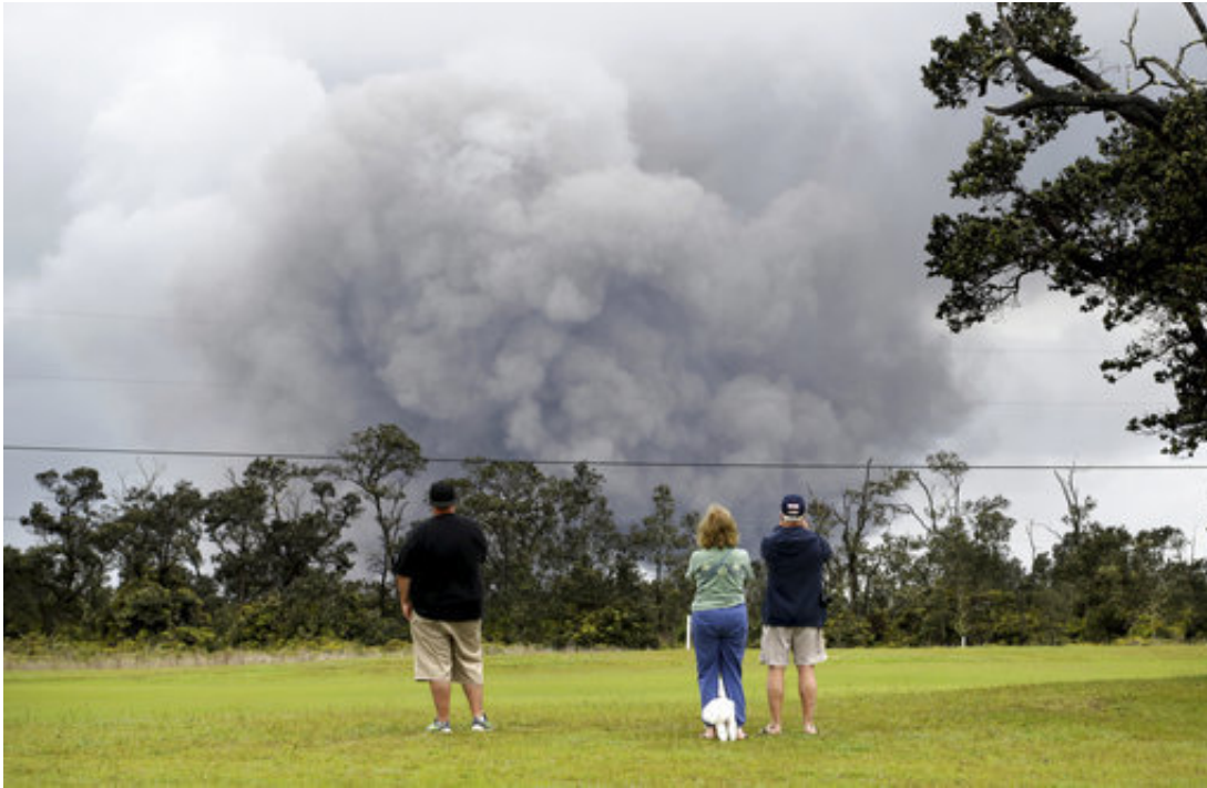
People watch as ash rises from the summit crater of Kilauea volcano, Thursday, May 17, 2018, in Volcano, Hawaii.

Geologists have warned that the volcano could become even more violent, with increasing ash production and the potential that future blasts could hurl boulders the size of cows from the summit.