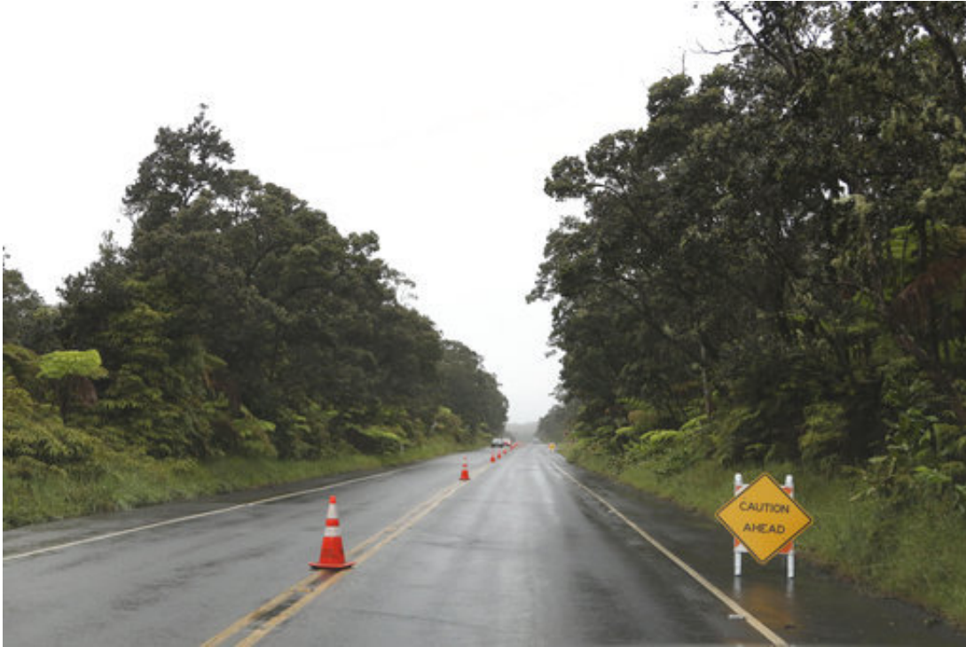
Cones and signs warn of cracks in the road near the entrance to Hawaii Volcanoes National Park, Thursday, May 17, 2018, near Volcano, Hawaii.