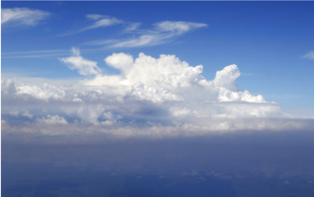
Clouds, ash and volcanic gases hang over Hawaii's Big Island, Thursday, May 17, 2018, after Kilauea volcano erupted from the summit crater earlier in the day.