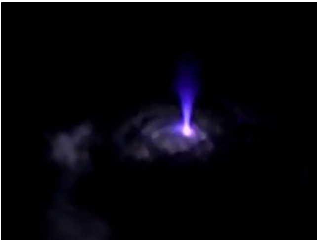
Blue Jet reaching 30 km upwards into the stratosphere as seen from the space station.

In 1990, the first observation of a sprite was documented, and since then ground and aircraft observations discovered a multitude of discharges above thunderstorms, and spacecraft in low orbit observed X- and gamma-ray radiation.