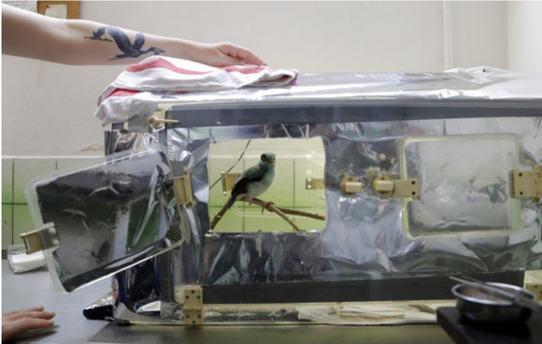
A keeper closes a box after feeding baby critically endangered Javan green magpie at the zoo in Prague, Czech Republic, Tuesday, April 17, 2018. The Javan green magpies are one of the most endangered birds on earth.