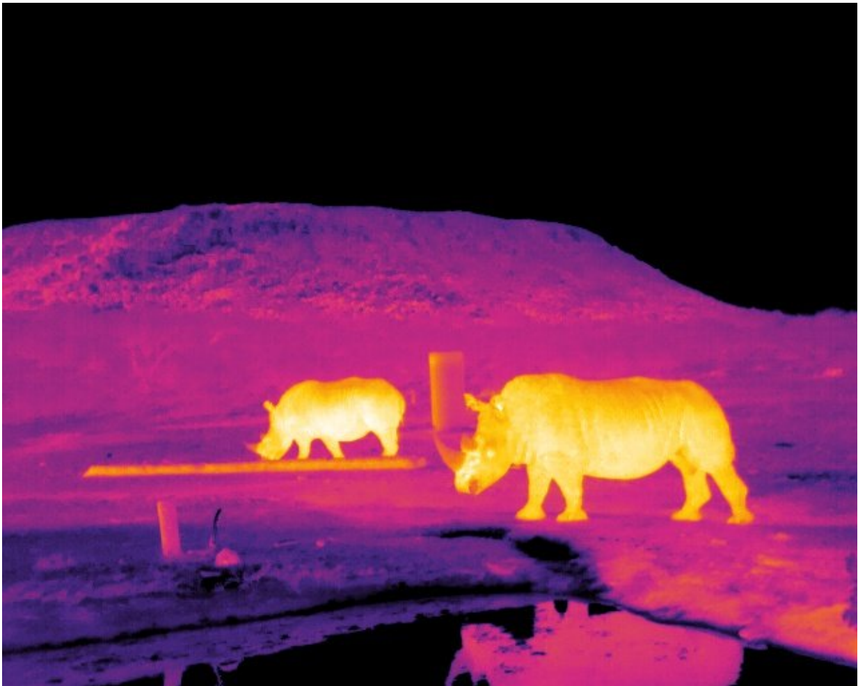
Infrared image of rhinos in South Africa.