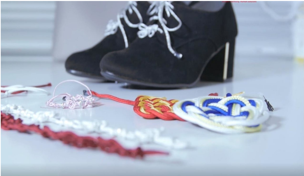
Fig.3. Fashionable sensors fabricated using piezoelectric PLLA braided cord.