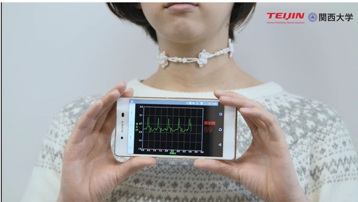
Fig. 4 Pulse wave signal described in the text.

clothes made with our PLLA braided cords," says Tajistu. "We are looking into possibilities for traditional Japanese clothing like women's Kimono with partners in Japan." The piezoelectric PLLA braided cord can be used as wearable sensors , mainly in the fields of fashion, sports apparel, interior design, and healthcare, by utilizing its fashionability and wearability, which cannot be achieved using conventional wearable sensing devices (Fig.3).