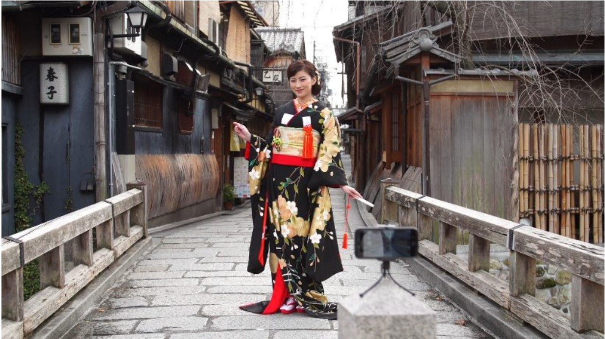
Fig.2. Taking a selfie with 'e-textiles': Traditional Japanese Kimono.

"Our research is aimed at developing functional apparel, sometimes referred to as 'e-textiles,'" says Tajitsu. "We believe that wearable human-machine devices will enable people to interface with external devices naturally, without being limited or hindered by having to perform complicated movements, such as focusing on a display panel to rely instructions. Also, 'e-textiles' must be comfortable and fashionable for wide spread acceptance. These ideas led to the development of our wearable sensors shaped like traditional Japanese braided cord or Kumihimo used in Kimono."