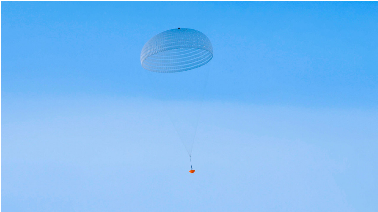
ExoMars parachute inflation.

"It was a very exciting moment to see this giant parachute unfurl and deliver the test module to the snowy surface in Kiruna, and we're looking forward to assessing the full parachute descent sequence in the upcoming high-altitude tests."