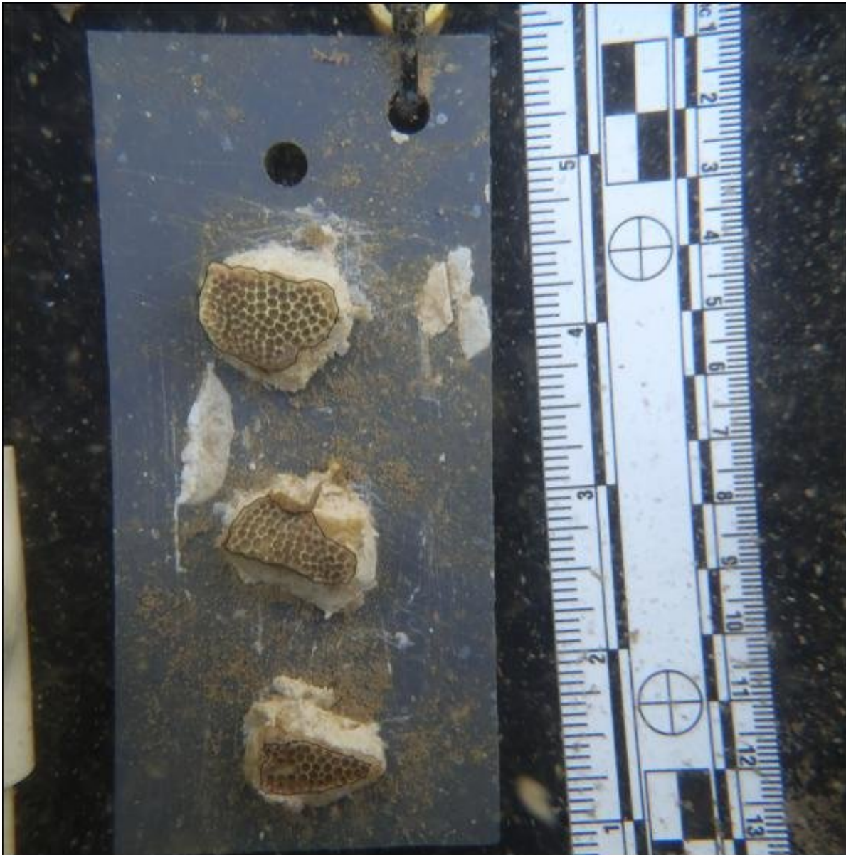
Coral pieces before the six-month deployment on the reef.