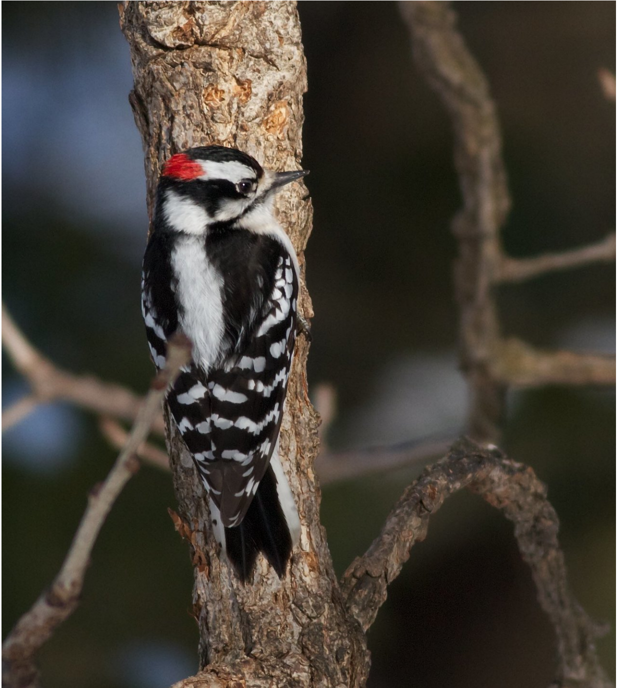
The woodpecker species analyzed in this study.