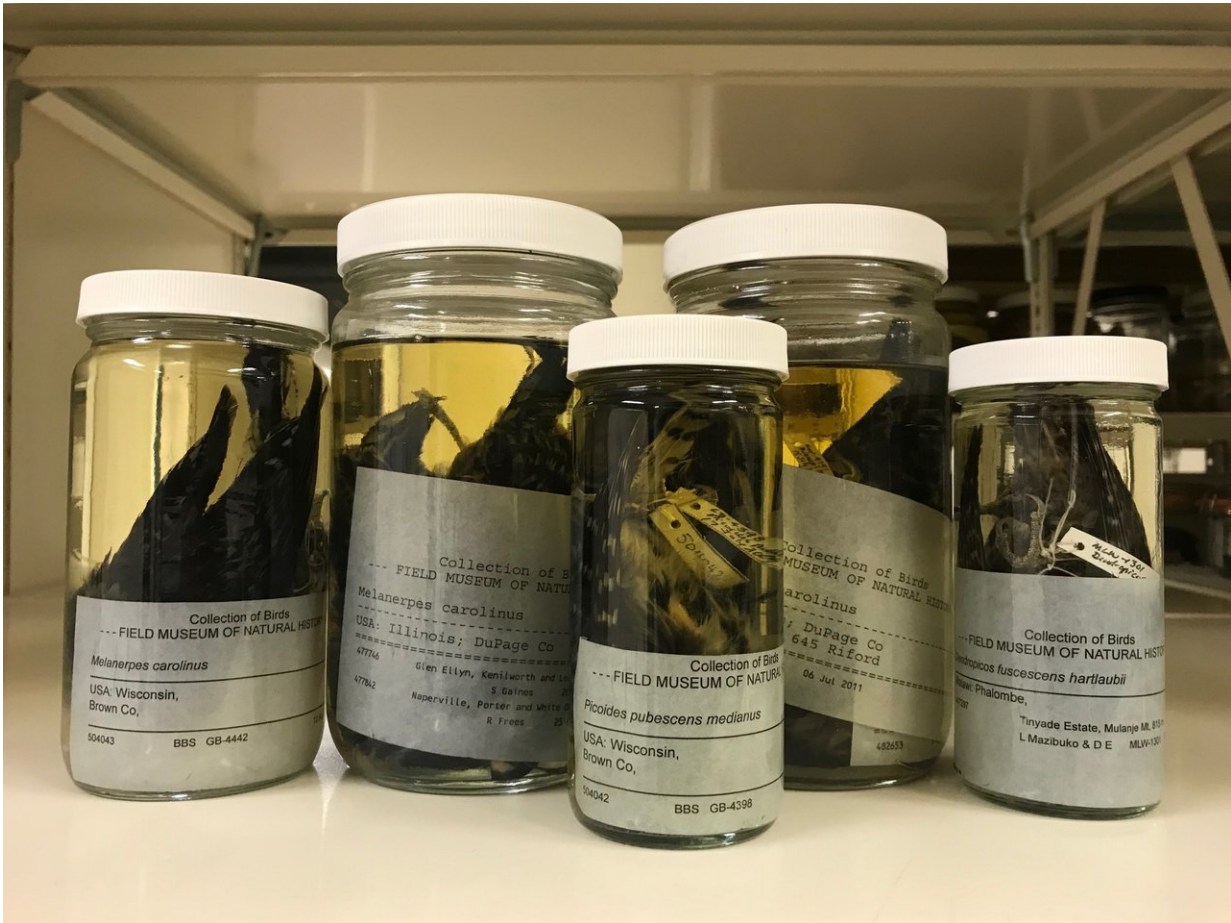
Woodpeckers preserved in alcohol at the Field Museum.

Since excessive tau can be a sign of brain damage in humans, Farah and his team decided to examine woodpecker brains for tau build-up. The Field Museum and Harvard loaned the researchers bird specimens pickled in alcohol—Downy Woodpeckers for the experimental data and non-head-injury-prone Red-winged Blackbirds as a control. The researchers then removed the birds' brains—"The brains themselves