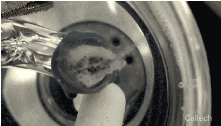
Gas generation by a solar-fuel catalyst.