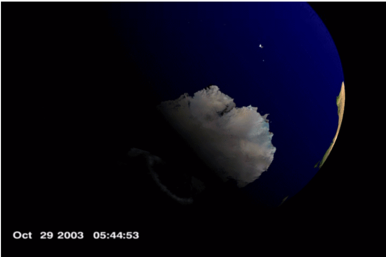
IMAGE captured the South Pole aurora caused by a coronal mass ejection in the fall of 2003.

that passing through a dramatic change in energy—such as what happens when a spacecraft experiences total darkness during an eclipse—could potentially reset the spacecraft. But after a 2007 eclipse failed to induce a reboot, the mission was declared over.