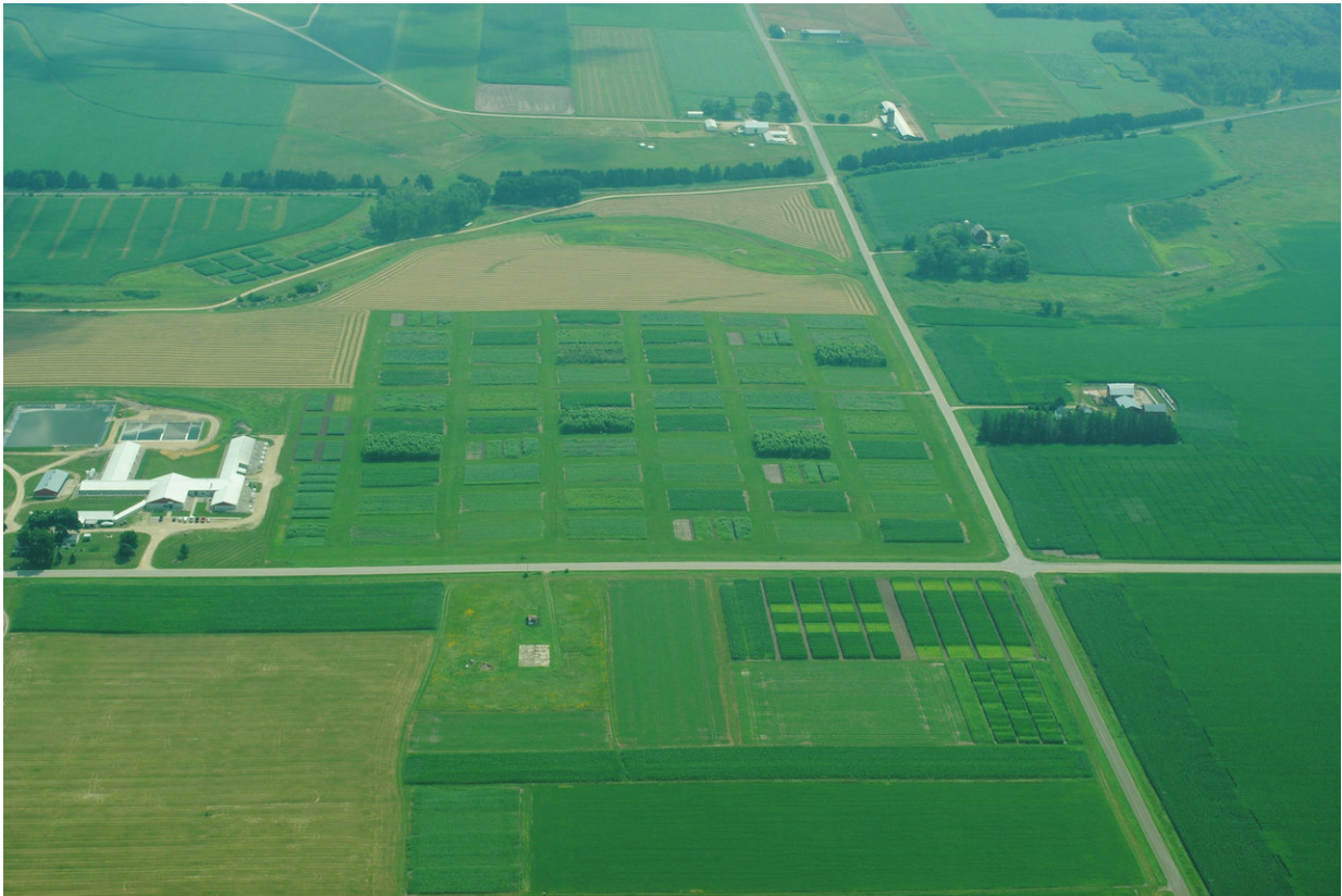
View of agricultural land in Wisconsin's Yahara River watershed.

The researchers reviewed stream data from the same period, when seven of the 11 largest rain storms since 1901 occurred.