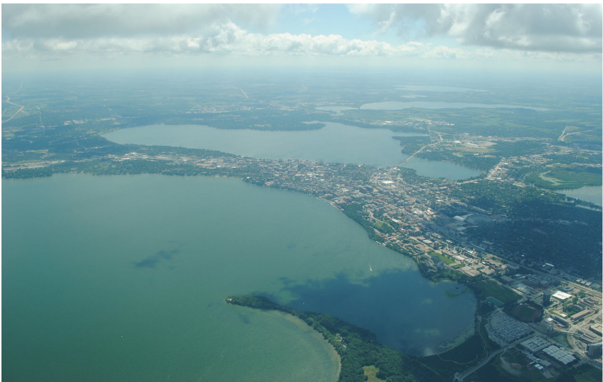
Aerial view of Lake Mendota covered with a bloom of cyanobacteria in summer.