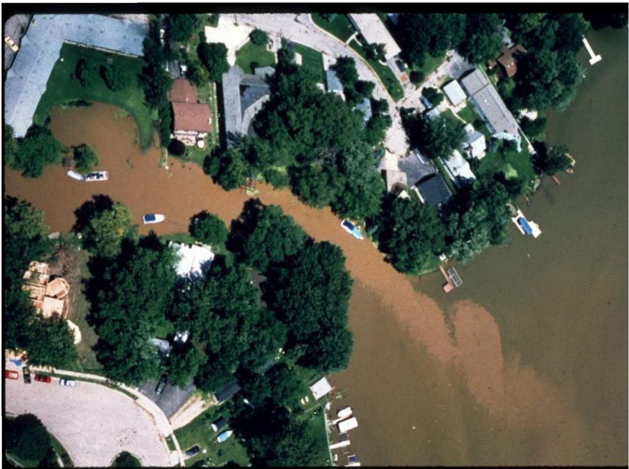
Sediment runoff into Lake Mendota following a summer thunderstorm.

The best available option for protecting water quality is to keep excess phosphorus off the landscape, Carpenter said. "A rainstorm can't wash fertilizer or manure downstream if it isn't there."