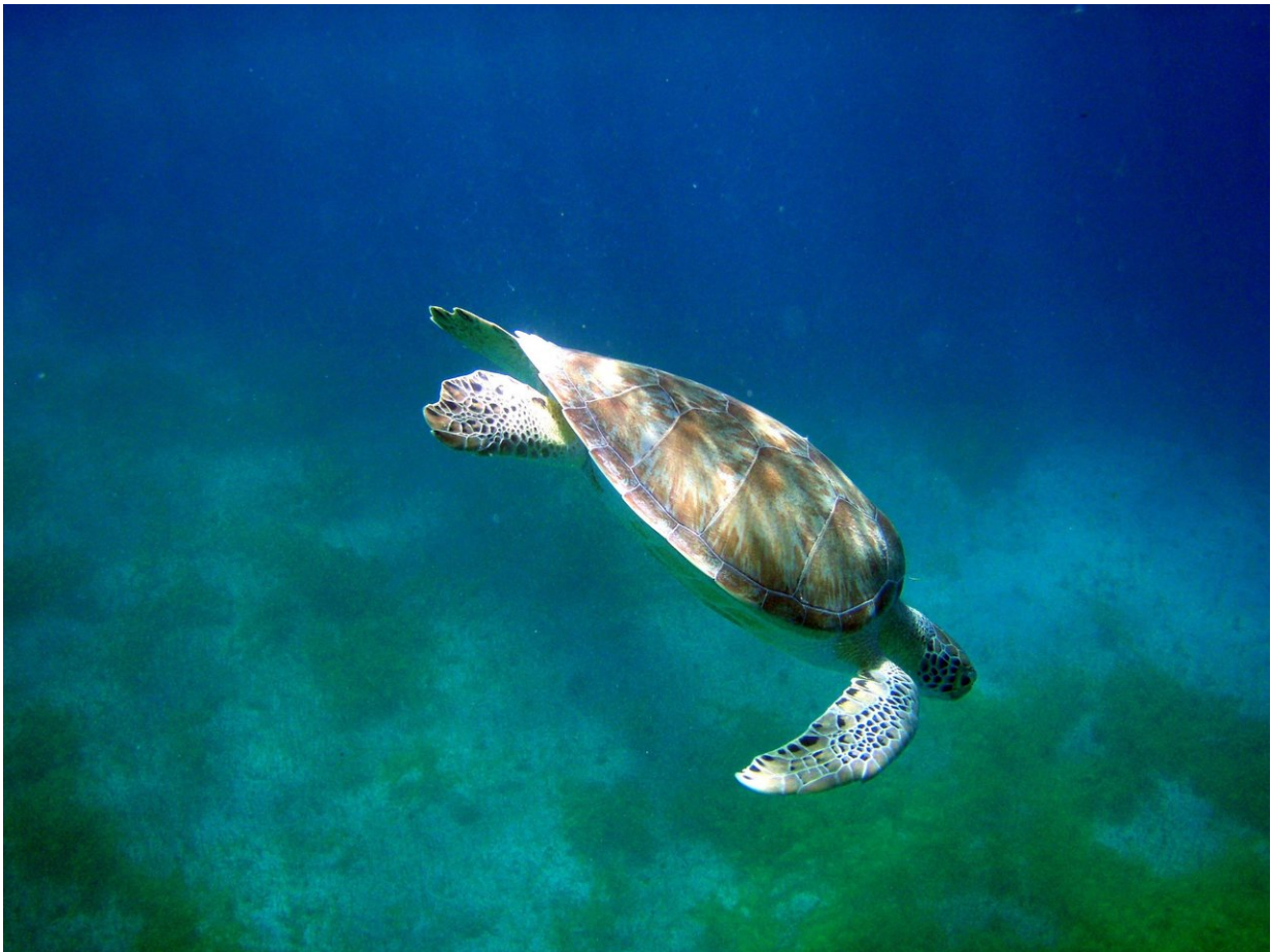
A green sea turtle, Chelonia mydas , off St. Thomas island.