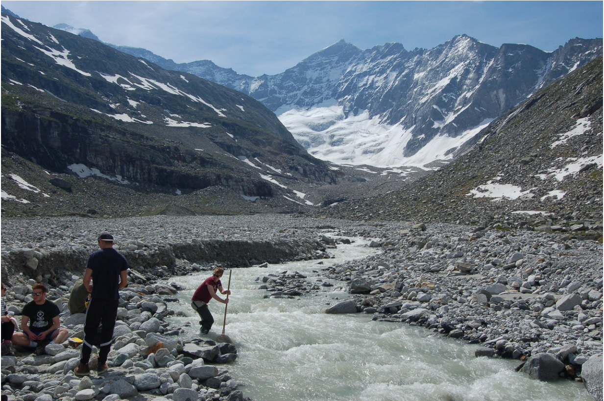
River invertebrate sample collection.