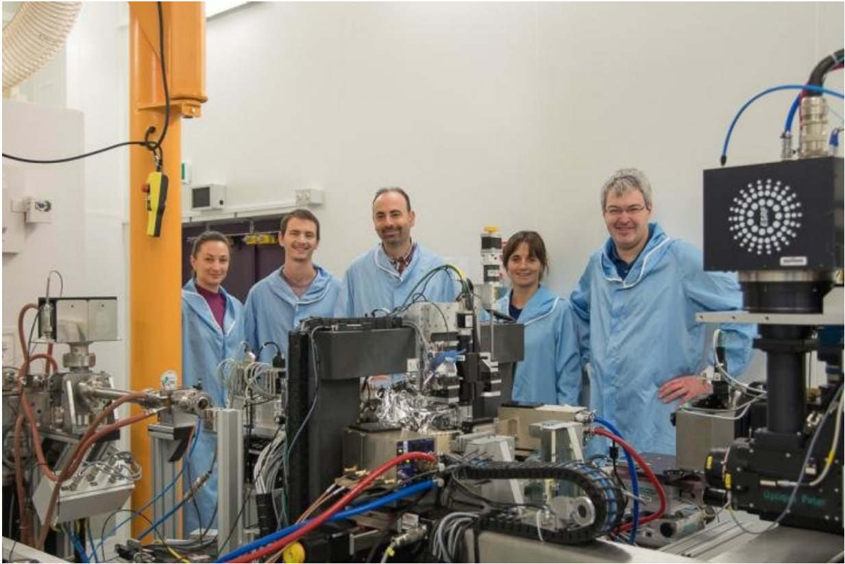
The team on the beamline's experimental hutch, at the ESRF, the European Synchrotron.

The international researchers discovered that the crucial stage in the process of lens formation is the transition from the amorphous phase—the phase between liquid and solid—to the crystalline phase. At this stage, calcite nanoparticles, which are rich in magnesium and characterized by a relatively low density, separate from the rest of the material. The difference in concentration of magnesium in the calcite particles causes various degrees of hardness, density, and pressure in different regions of the material. Magnesium-rich particles press on the inner part of the lens as it crystallizes and "temper" it into a clear and tough crystalline material.