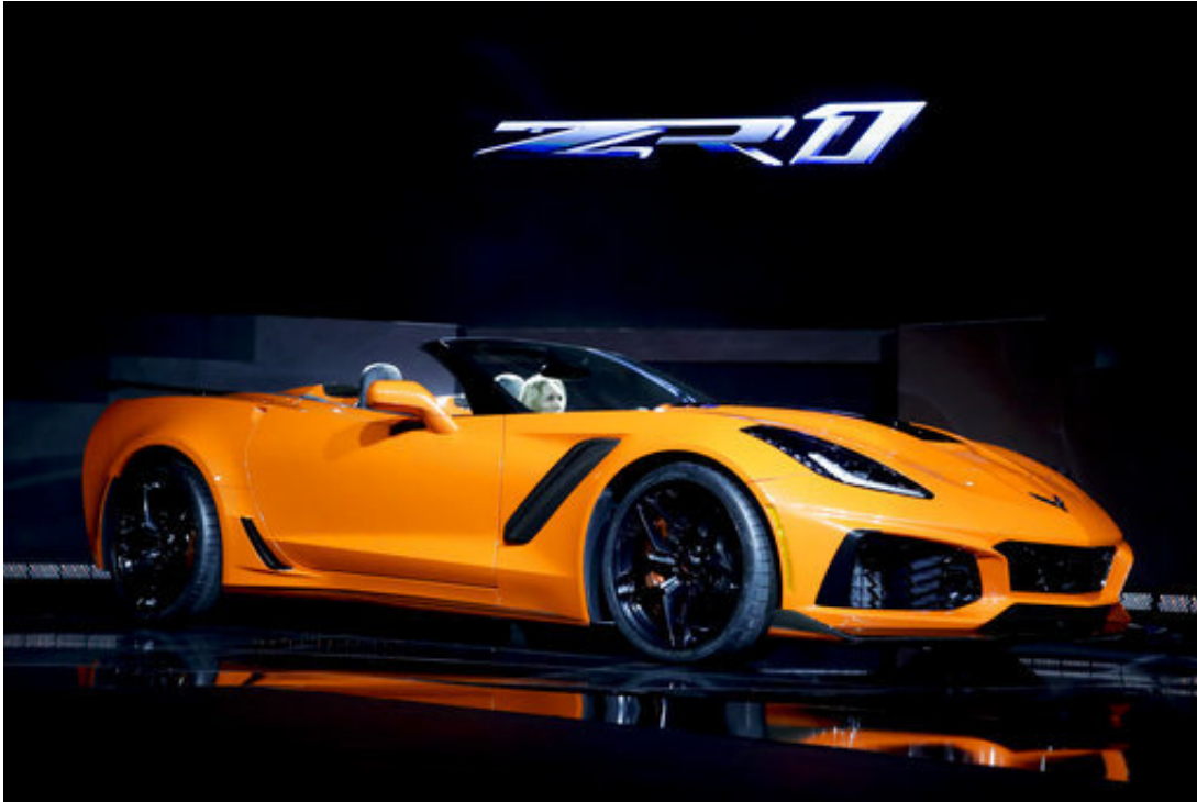
The 2019 Chevrolet Corvette ZR1 convertible is revealed during the AutoMobility LA auto show Tuesday, Nov. 28, 2017, in Los Angeles.