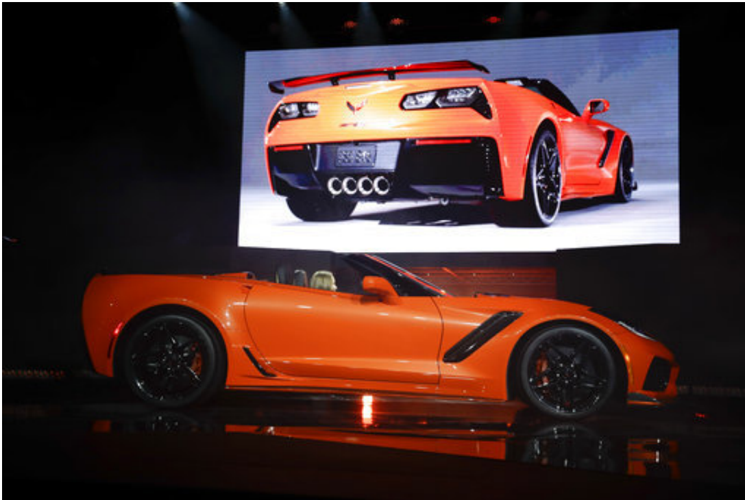
The 2019 Chevrolet Corvette ZR1 convertible is revealed during the AutoMobility LA auto show Tuesday, Nov. 28, 2017, in Los Angeles.