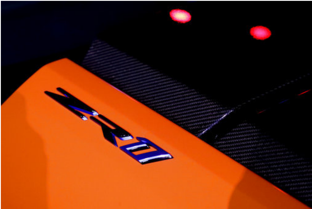
The 2019 Chevrolet Corvette ZR1 convertible logo is shown during the AutoMobility LA auto show Tuesday, Nov. 28, 2017, in Los Angeles.