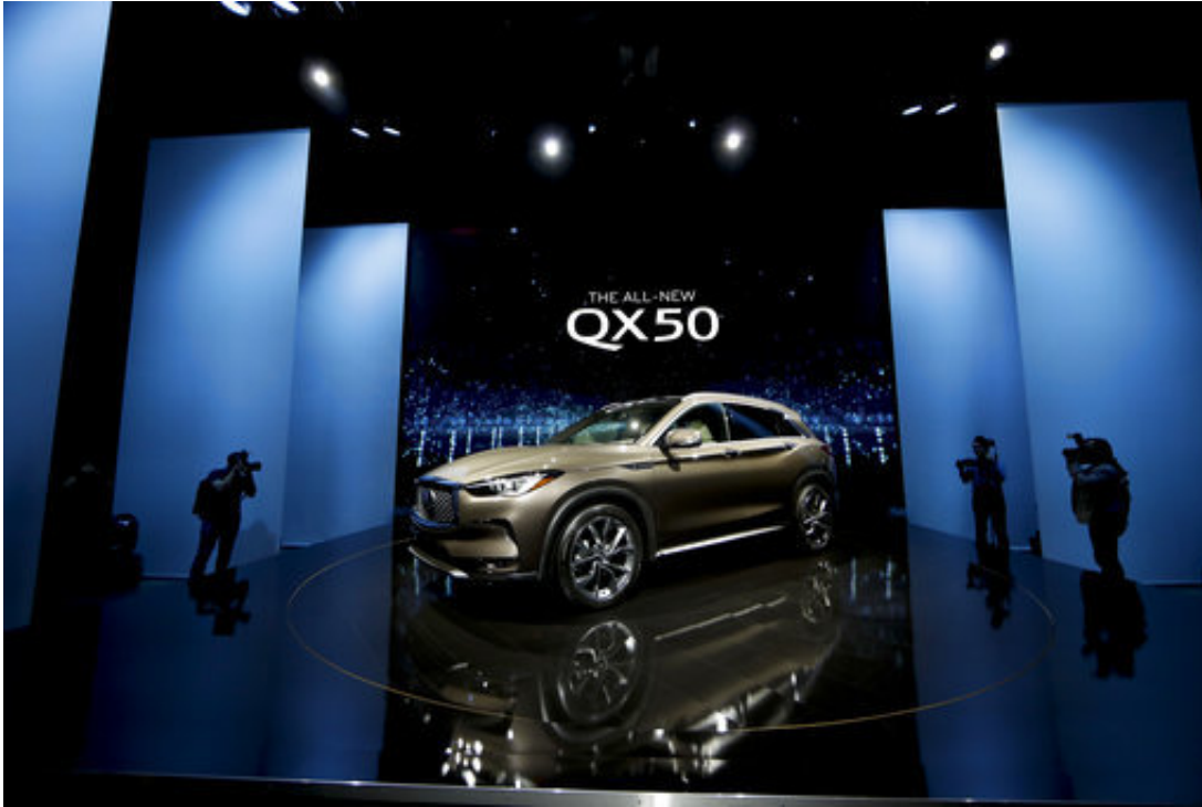
The 2018 Infiniti QX50 is revealed as part of the AutoMobility LA auto show Tuesday, Nov. 28, 2017, in Hawthorne, Calif.