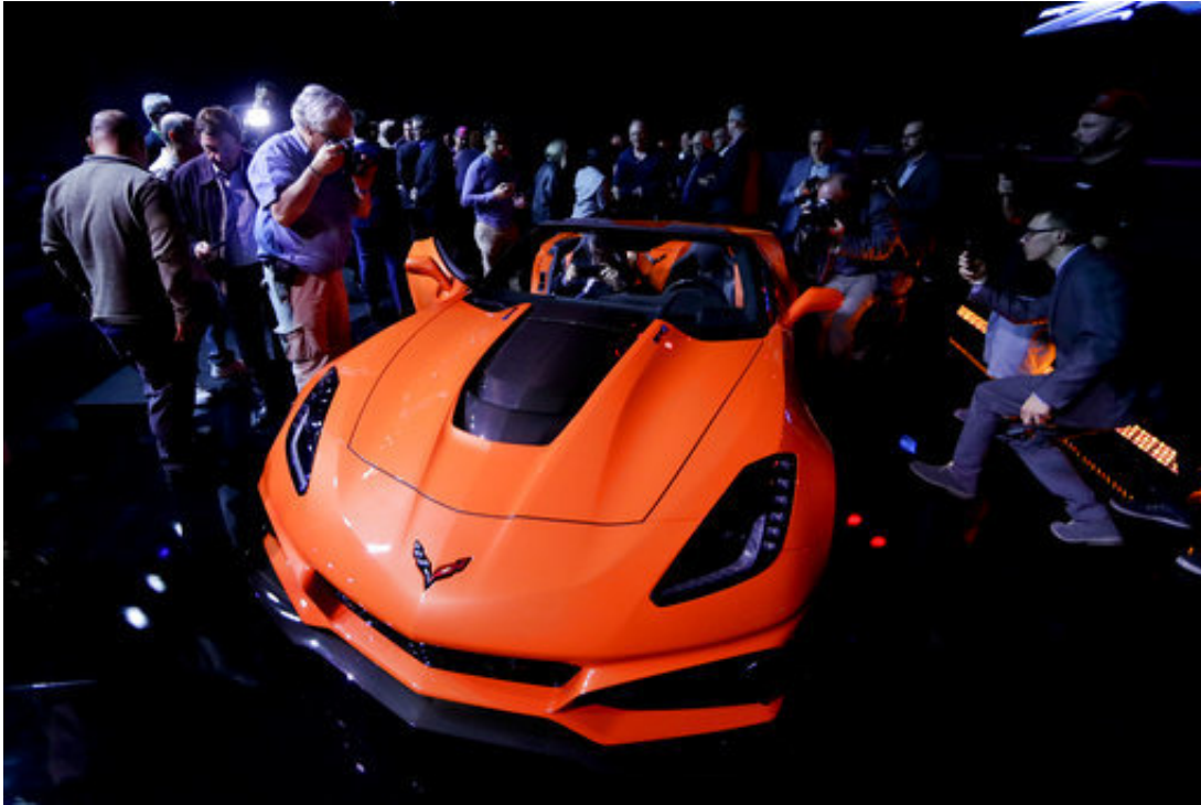
People gather around the 2019 Chevrolet Corvette ZR1 convertible after it was revealed during the AutoMobility LA auto show Tuesday, Nov. 28, 2017, in Los Angeles.