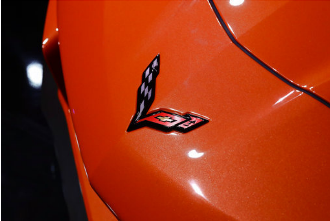
The 2019 Chevrolet Corvette ZR1 convertible hood logo is shown during the AutoMobility LA auto show Tuesday, Nov. 28, 2017, in Los Angeles.