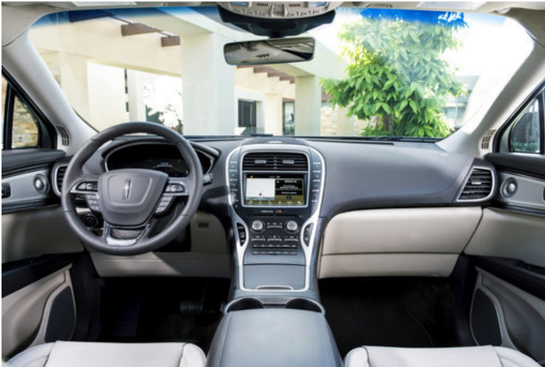
This photo provided by Ford Motor Co. shows the interior of the 2019 Lincoln Nautilus. The 2019 Nautilus swaps its V6 engine for two turbocharged four-cylinder choices. (James Lipman/Ford Motor Co. via AP)