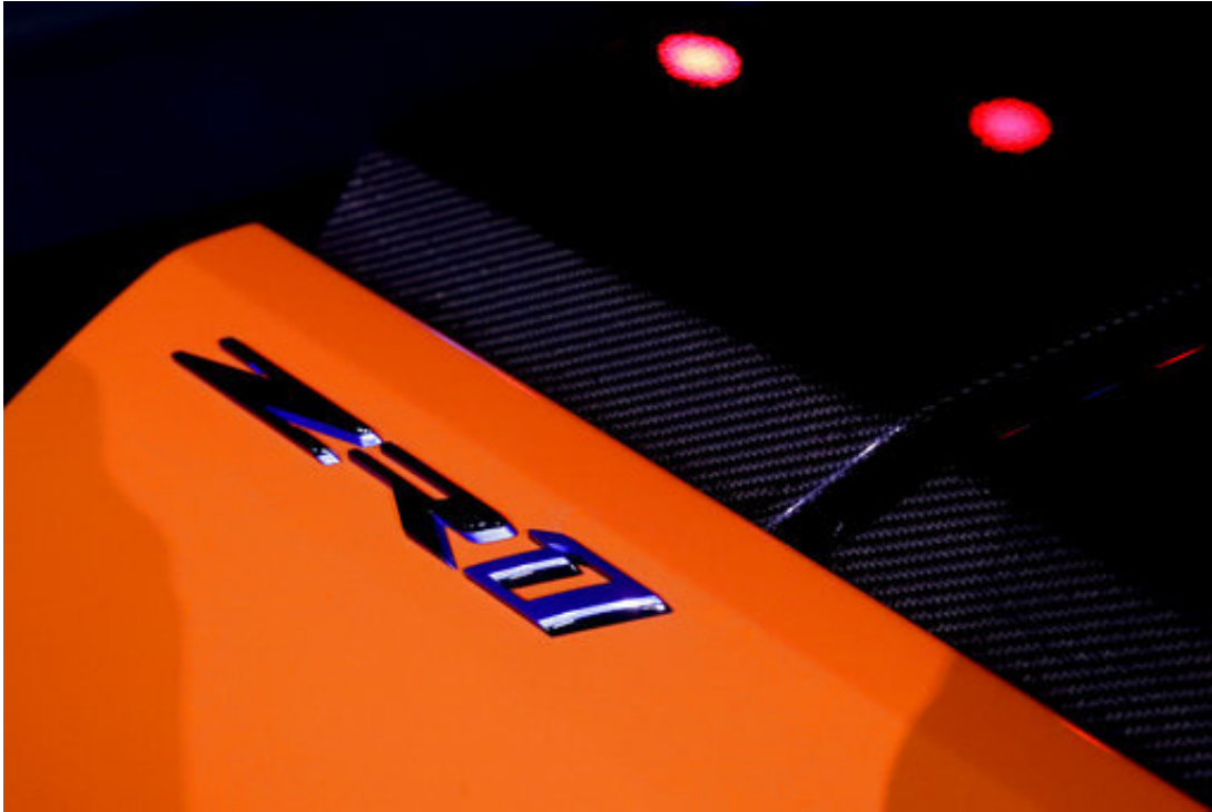
The 2019 Chevrolet Corvette ZR1 convertible logo is shown during the AutoMobility LA auto show Tuesday, Nov. 28, 2017, in Los Angeles.