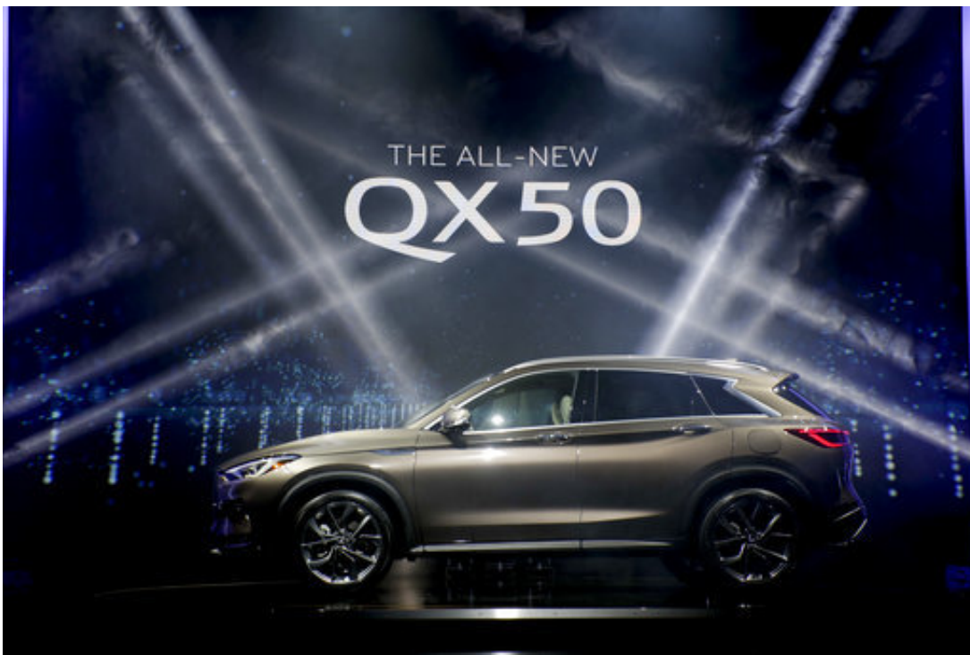
The 2018 Infiniti QX50 is revealed as part of the AutoMobility LA auto show Tuesday, Nov. 28, 2017, in Hawthorne, Calif.