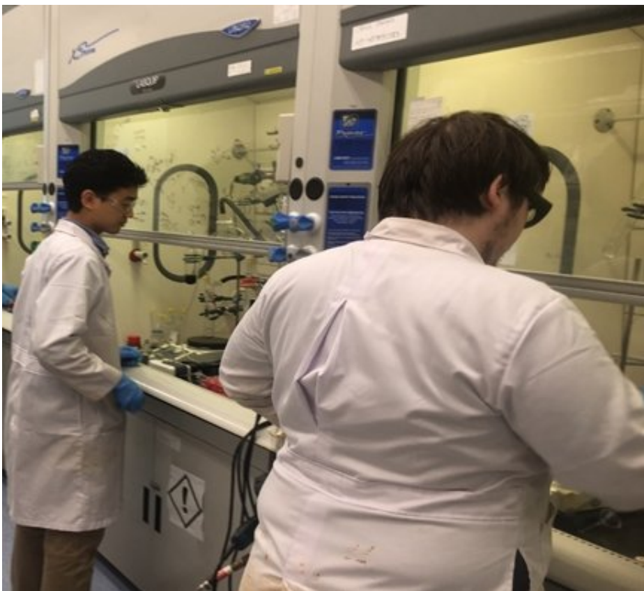
Photo showing the research team carrying out chemical experiments using fume hoods in the laboratory.