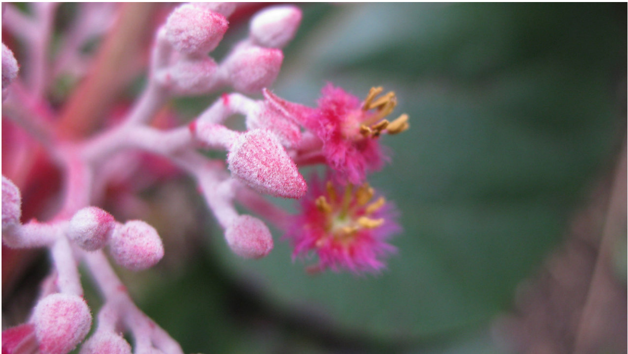
Petenaea cordata.