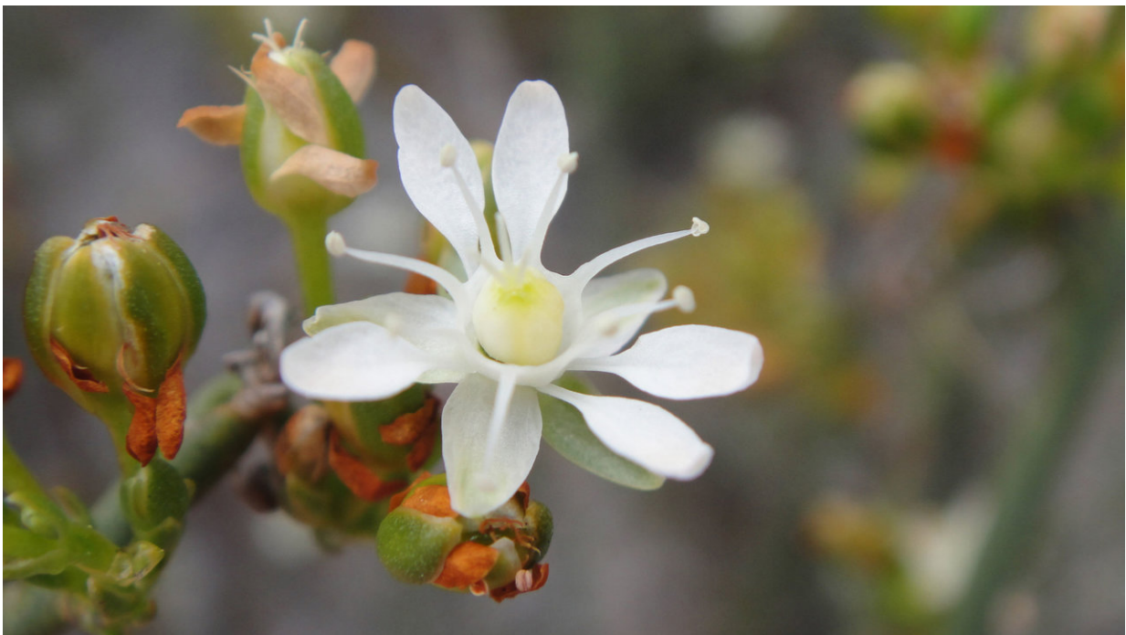
Macarthuria australis.

I have been passionate about plants all my life, as have my two co-authors. And through our careers we've published many scientific and popular works on a wide range of plant families. We hope that our enthusiasm for plant diversity and how plants are used by humans will engender similar enthusiasm among our readers. Plants are, after all, the basis of life on earth.