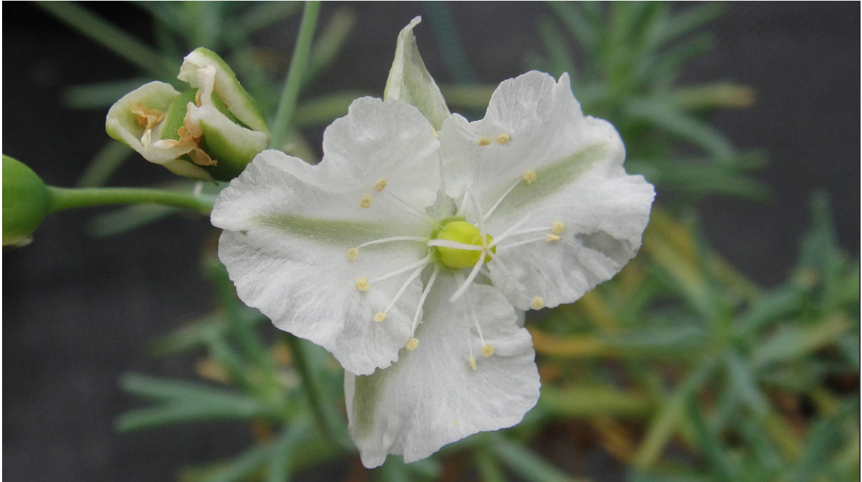
Kewia acidula.