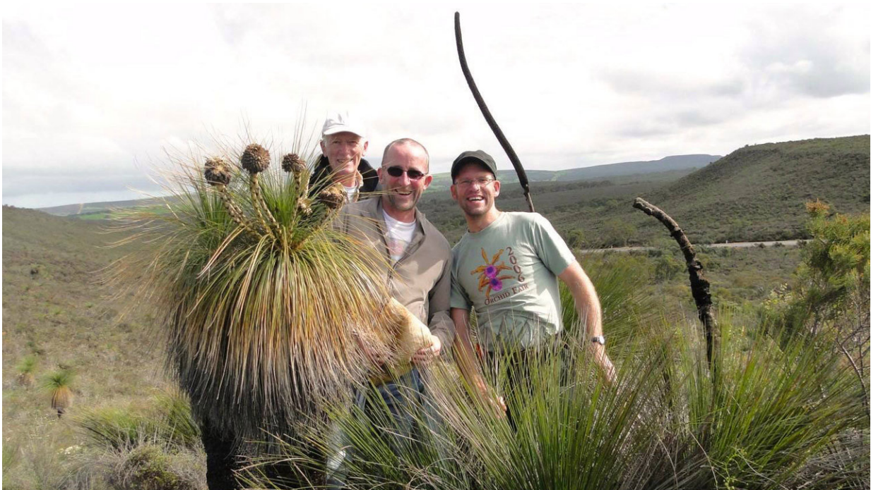
The authors plus grass trees.

We have endured tropical diseases, parasites, altitude sickness and disgusting smells. We have avoided saltwater crocodiles, tarantulas and poisonous snakes, overcome phobias of leeches and heights and survived robberies, volcanoes, earthquakes and riots – Mark was even abandoned on a remote mountain by a grumpy helicopter pilot. The life of a botanist is not always a bed of roses!