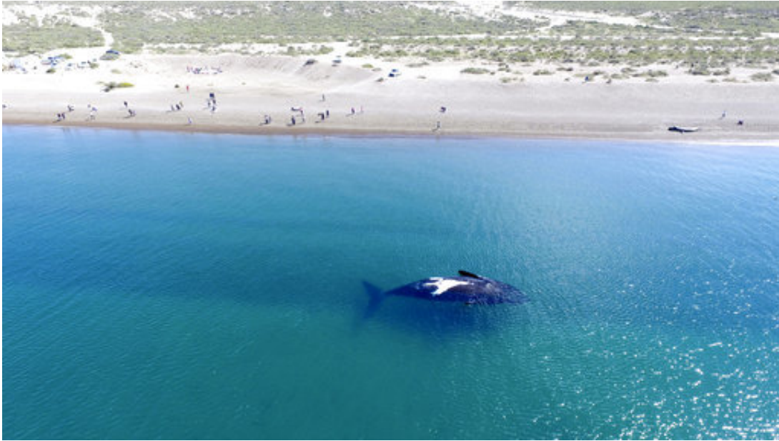
In this Sept. 26, 2017 photo, a Southern right whale swims on the surface near the coast of El Doradillo Beach, Patagonia, Argentina. A record number of Southern right whales migrate each year from Antarctica to Argentina's Patagonia to give birth and feed their offspring.