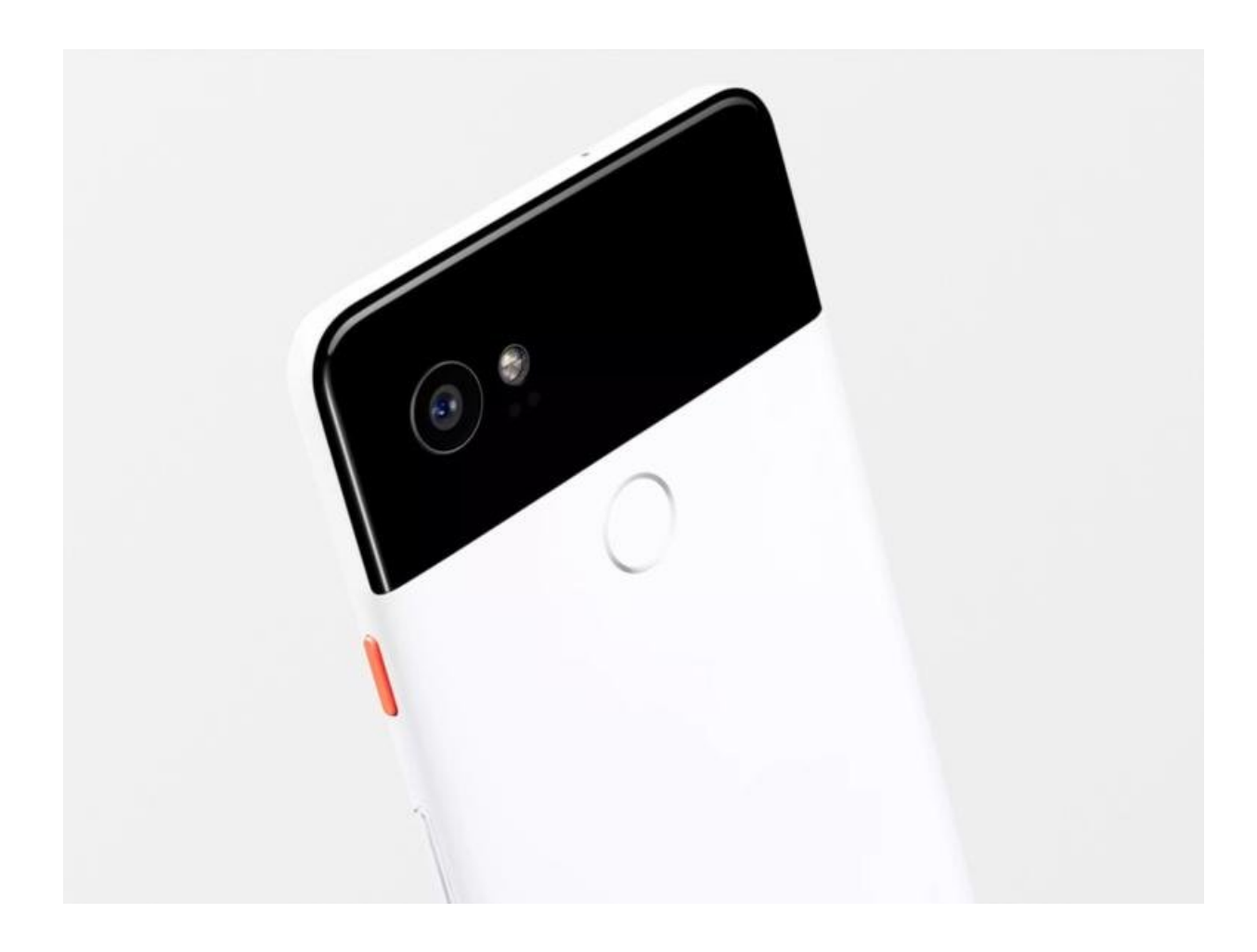
The Google Pixel 2 XL.

Fogg said the use of computation to improve images with a single lens "is technically impressive."