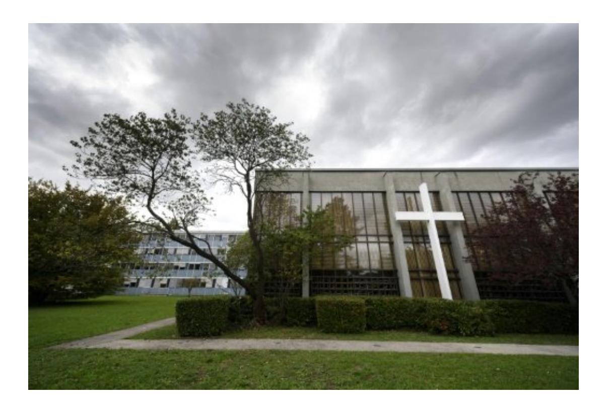
ICAN, which was founded in Vienna in 2007, is based in Geneva inside a centre belonging to the World Council of Churches

From its offices in the buildings of the World Council of Churches in Geneva, ICAN works with 468 non-governmental organisations across 101 countries, including rights, development, environmental and peace groups.