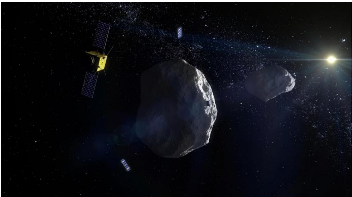
Artist's impression of ESA's AIM mission encountering asteroid Didymos.

Galache explains: "NEAs are usually discovered when they are at their brightest, so our best chance of studying them is by immediately following up detections with further observations to characterise their shape and spectral properties. That needs good quality, relatively large, dedicated telescopes that are available at short notice. We don't have reliable access to these facilities right now."