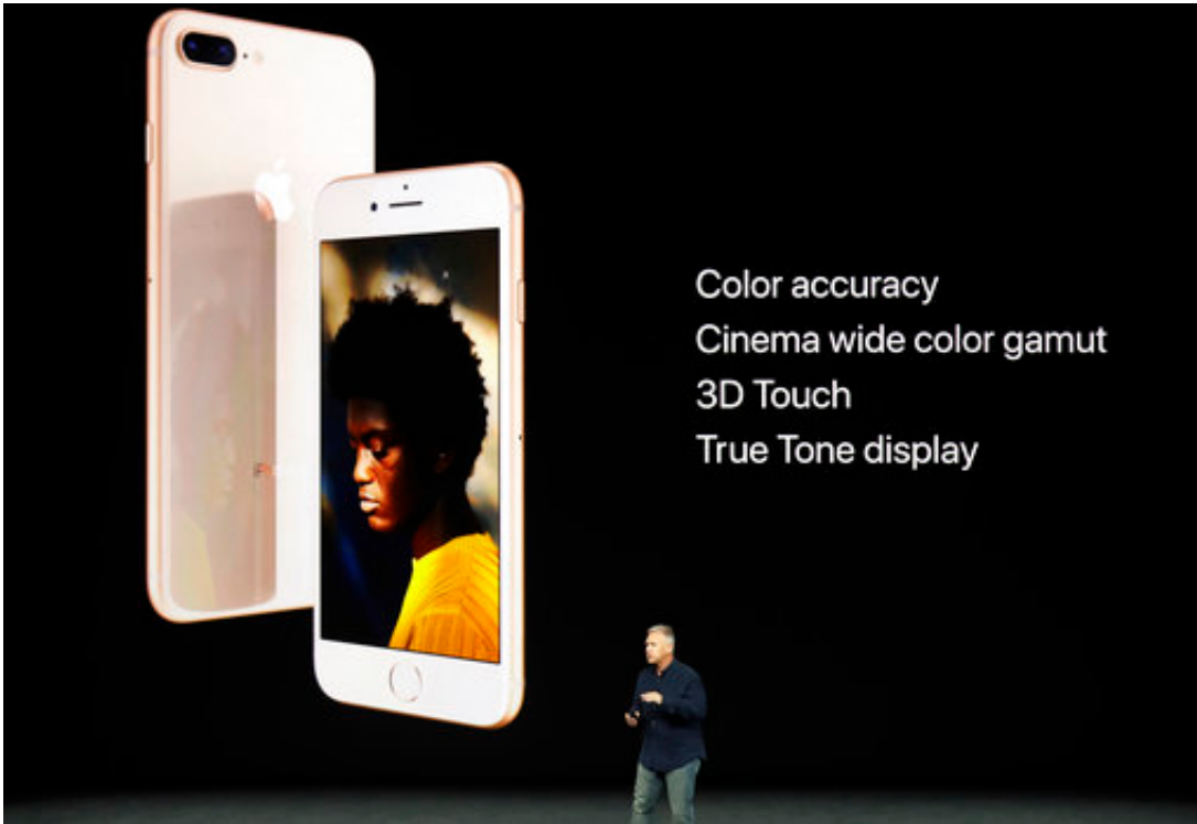
Phil Schiller, Apple's senior vice president of worldwide marketing, shows the new iPhone 8 at the Steve Jobs Theater on the new Apple campus on Tuesday, Sept. 12, 2017, in Cupertino, Calif.