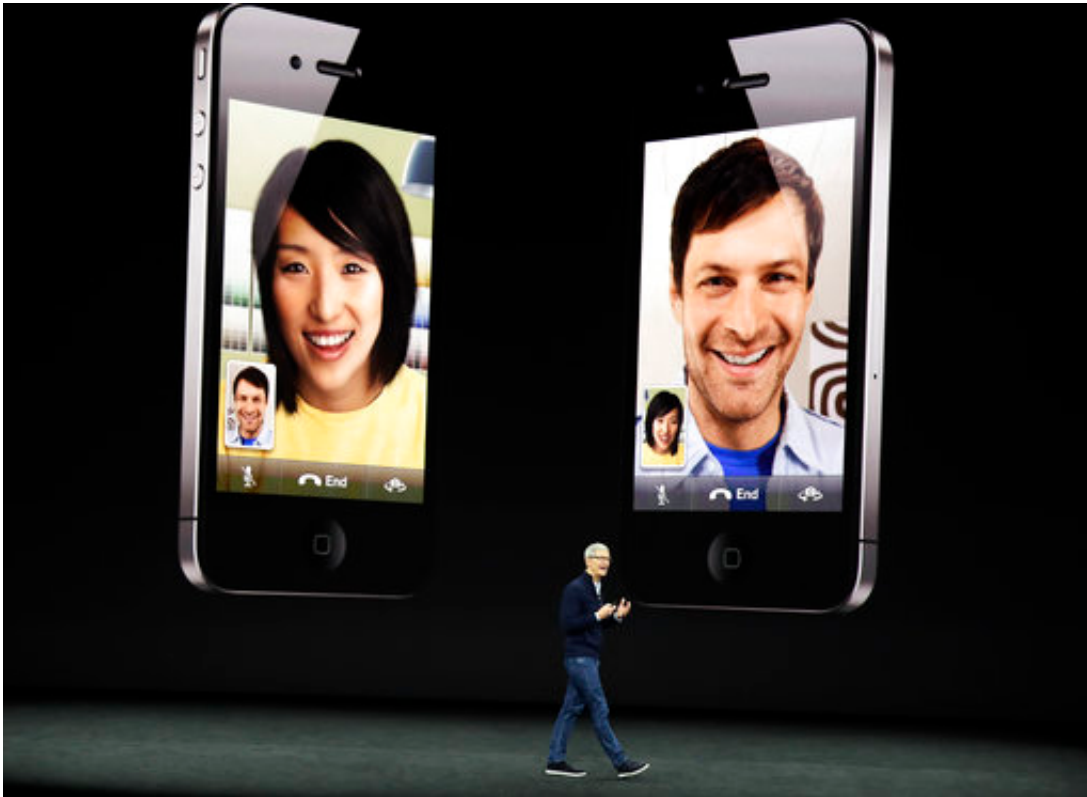
Apple CEO Tim Cook discusses the new iPhone 8 at the Steve Jobs Theater on the new Apple campus, Tuesday, Sept. 12, 2017, in Cupertino, Calif.