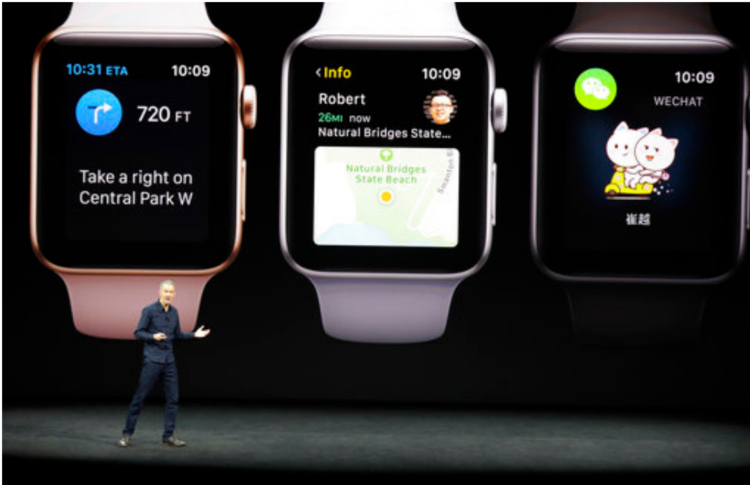
Jeff Williams, Apple's chief operating officer, shows new Apple Watch products at the Steve Jobs Theater on the new Apple campus on Tuesday, Sept. 12, 2017, in Cupertino, Calif.