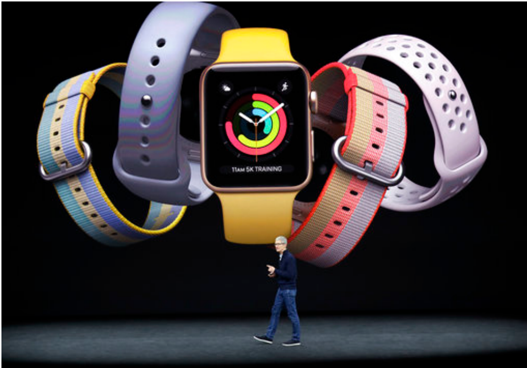
Apple CEO Tim Cook shows new products at the Steve Jobs Theater on the new Apple campus on Tuesday, Sept. 12, 2017, in Cupertino, Calif.