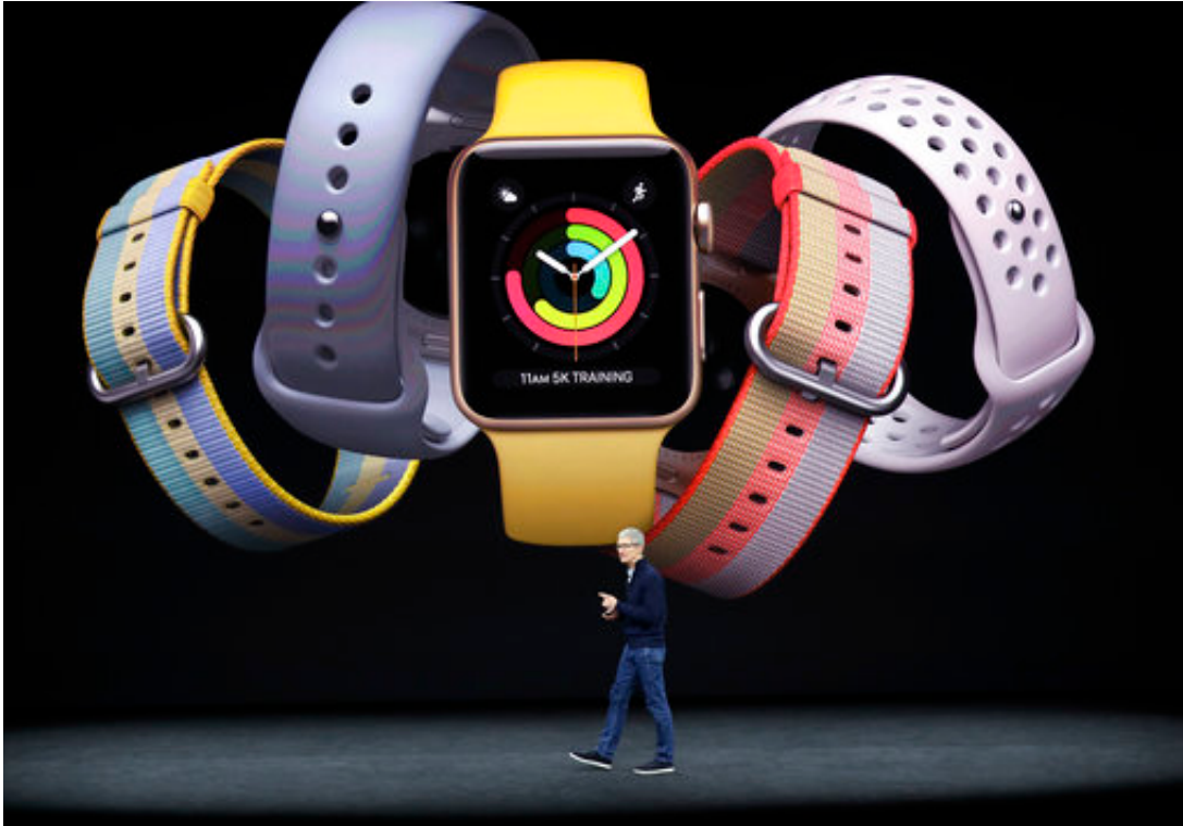
Apple CEO Tim Cook shows new products at the Steve Jobs Theater on the new Apple campus on Tuesday, Sept. 12, 2017, in Cupertino, Calif.