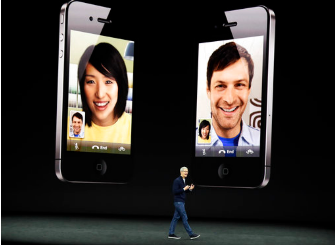
Apple CEO Tim Cook discusses the new iPhone 8 at the Steve Jobs Theater on the new Apple campus, Tuesday, Sept. 12, 2017, in Cupertino, Calif.