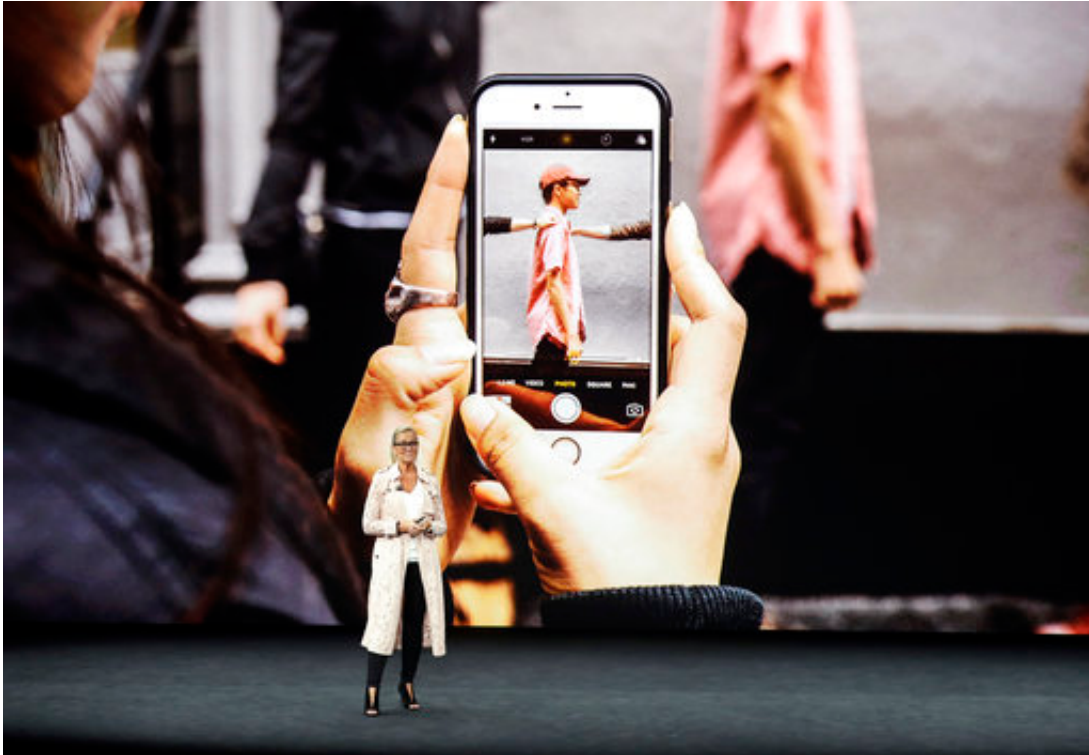
Angela Ahrendts, Apple's Senior Vice President of Retail, discusses updates at Apple Stores before a new product announcement at the Steve Jobs Theater on the new Apple campus on Tuesday, Sept. 12, 2017, in Cupertino, Calif.