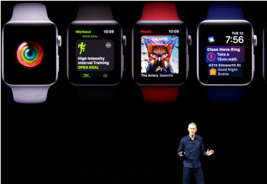
Jeff Williams, Apple's chief operating officer, shows new Apple Watch products at the Steve Jobs Theater on the new Apple campus on Tuesday, Sept. 12, 2017, in Cupertino, Calif.