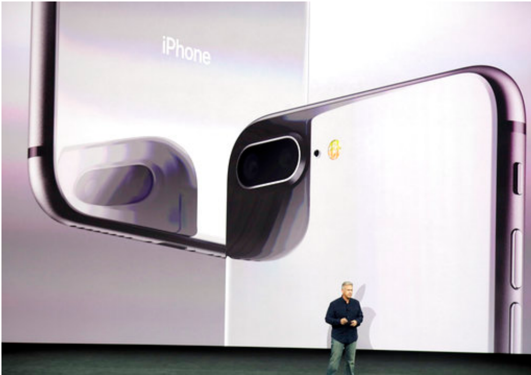
Phil Schiller, Apple's senior vice president of worldwide marketing, shows the new iPhone 8 at the Steve Jobs Theater on the new Apple campus on Tuesday, Sept. 12, 2017, in Cupertino, Calif.