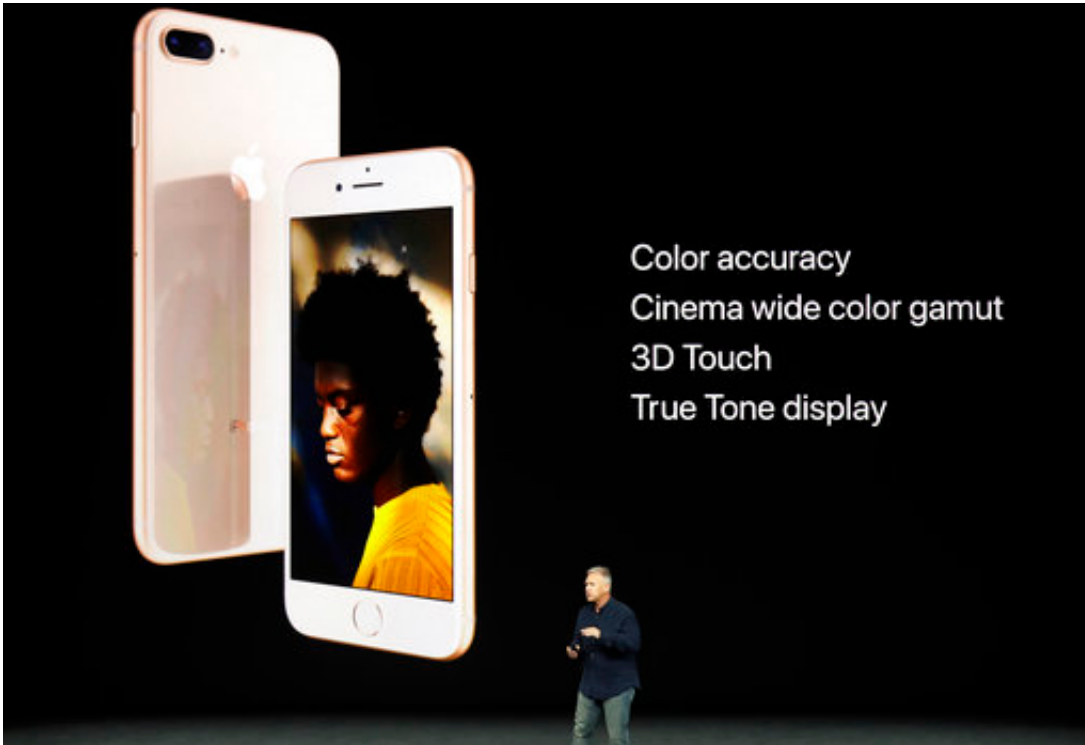
Phil Schiller, Apple's senior vice president of worldwide marketing, shows the new iPhone 8 at the Steve Jobs Theater on the new Apple campus on Tuesday, Sept. 12, 2017, in Cupertino, Calif.