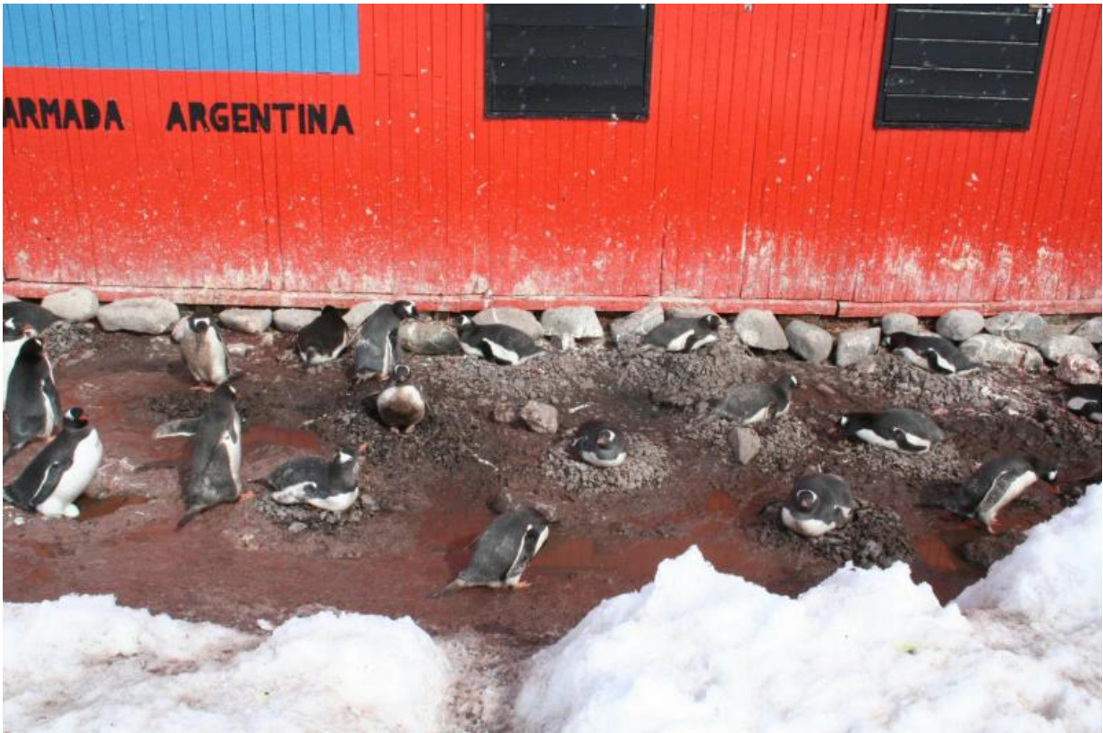
Gentoo penguins nesting at the base of an emergency hut at Petermann Island, Antarctica

We can use the area of the colony (as defined by the guano stain) to work back to the number of pairs that must have been inside the colony."