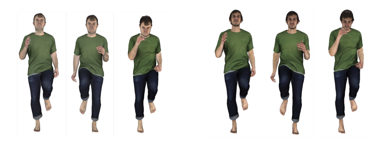
Figure 1: ClothCap enables automatic transfer of 3D clothing to new bodies. Captured subject on the left. Synthetic animation on the right for a new body.

Researchers at the Max Planck Institute for Intelligent Systems (MPI-IS) have developed technology to digitally capture clothing on moving people, turn it into a 3-D digital form, and dress virtual avatars with it. This new technology makes virtual clothing try-on practical.