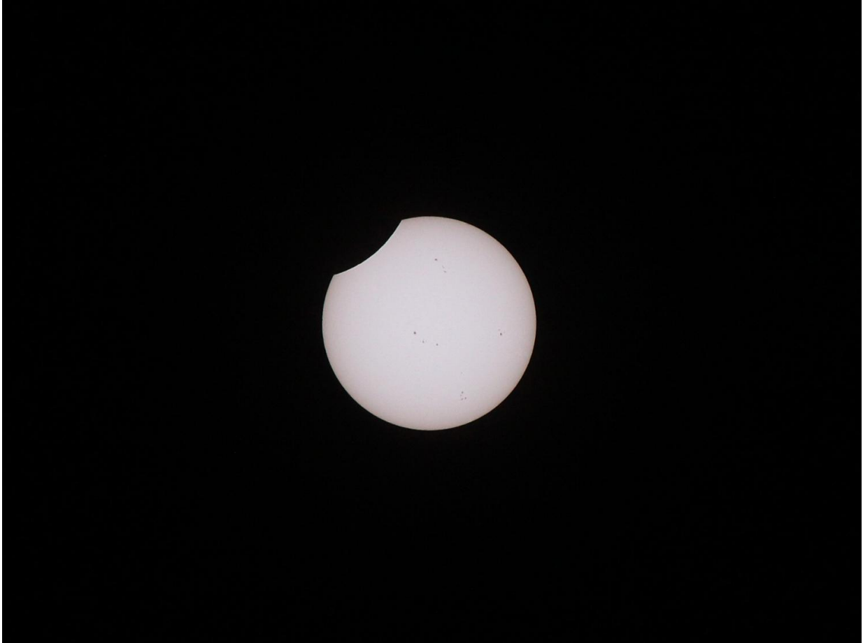
Image of the partially eclipsed sun, photographed through a telephoto lens capped with a special-purpose solar filter. The moon covers 10 percent of the sun's diameter and not quite 2 percent of its area. Dark sunspots speckle the solar disk.