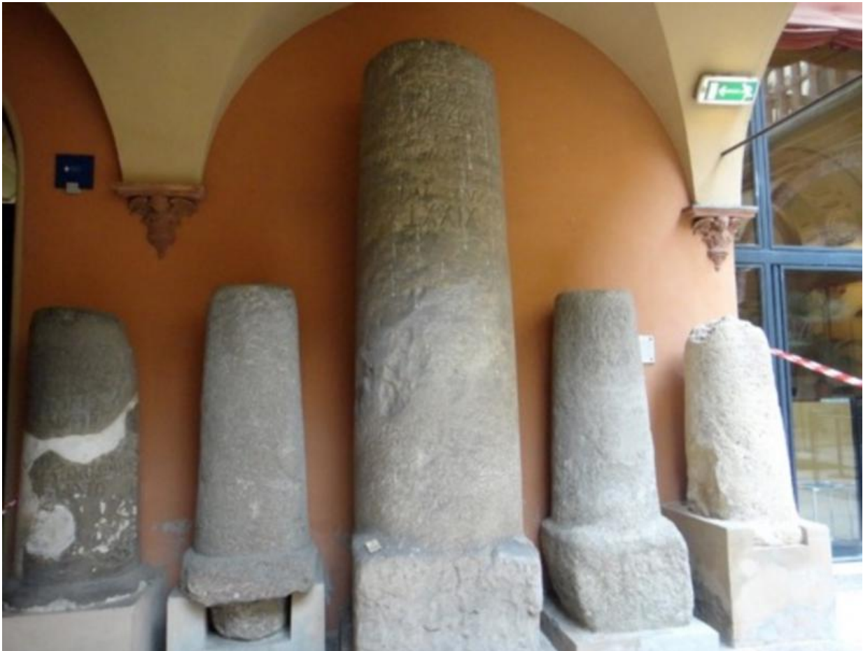
Roman Milestones in the Bologna Archaeological Museum.