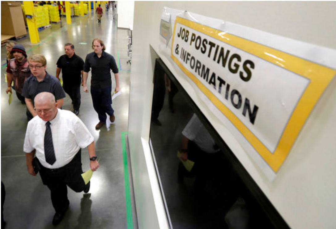
Job candidates take a tour of the Amazon fulfillment center in Robbinsville, N.J., during a job fair, Wednesday, Aug. 2, 2017. Amazon plans to make thousands of job offers on the spot at nearly a dozen U.S. warehouses.