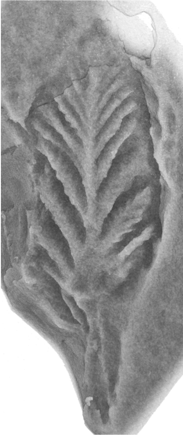
Avalofractus abaculus

"What we wanted to know is why these large organisms appeared at this