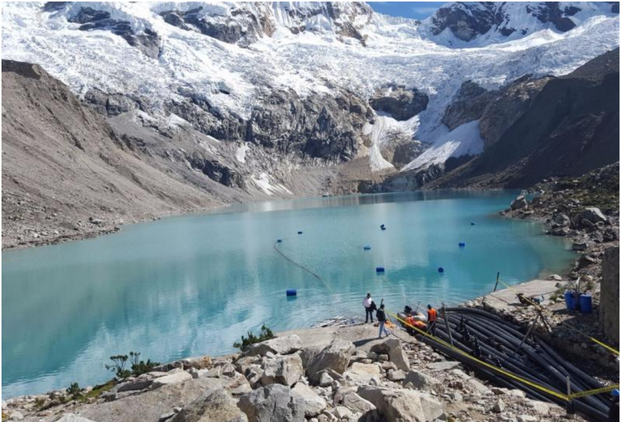
Pucaranra Glacier, Lake Palcacocha, and syphons at the moraine.

called for increased investment in infrastructure at the lake to reduce the risks of a flood. They estimated that an expenditure of US $6 million would prevent about $2.5 billion in potential damages, including a hydroelectric plant and irrigation facilities on Peru's desert coast; it would also protect the lives of the 50,000 people who live in the potential flood zone.