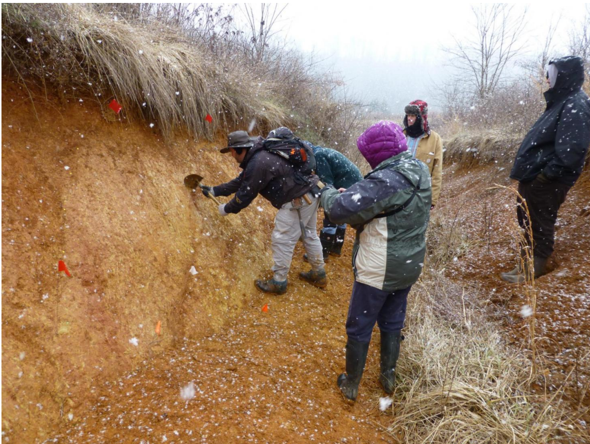
Researchers examine sediments for seismic signatures at the winter waterline of Douglas Lake, Tennessee.