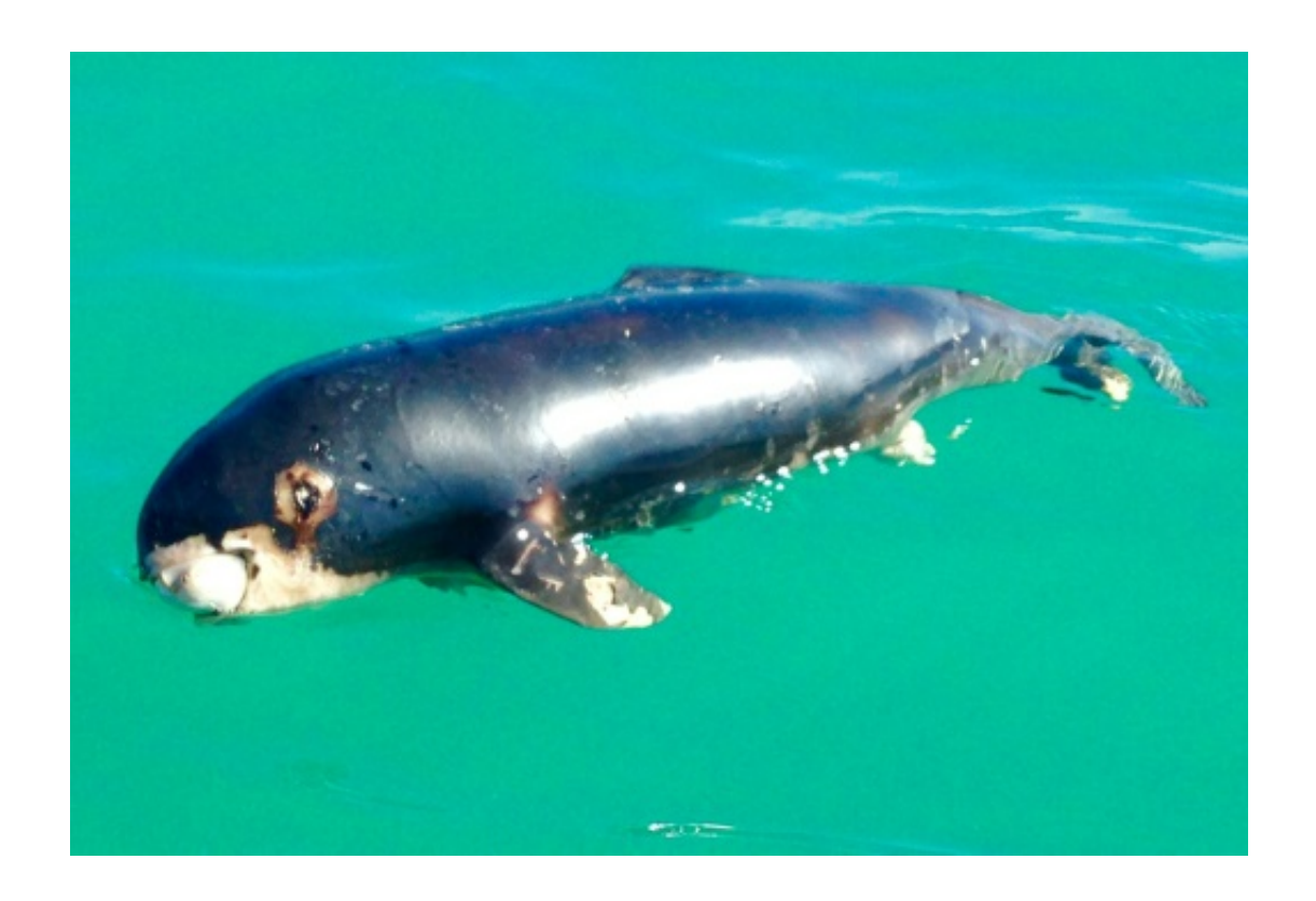
The World Wildlife Fund (WWF) has warned the vaquita risks going extinct in 2018

The World Wildlife Fund (WWF) praised the "landmark agreement."