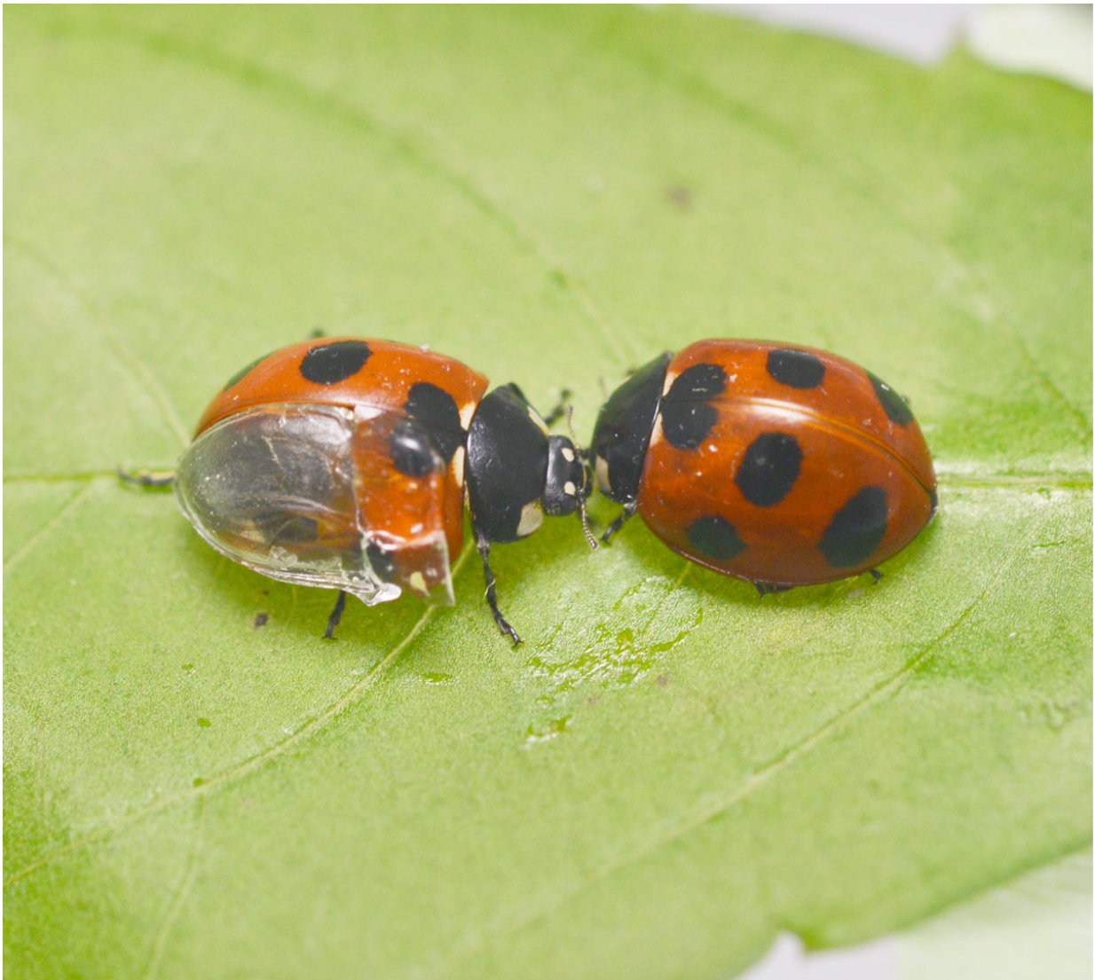
Ladybird beetle with artificial elytron.