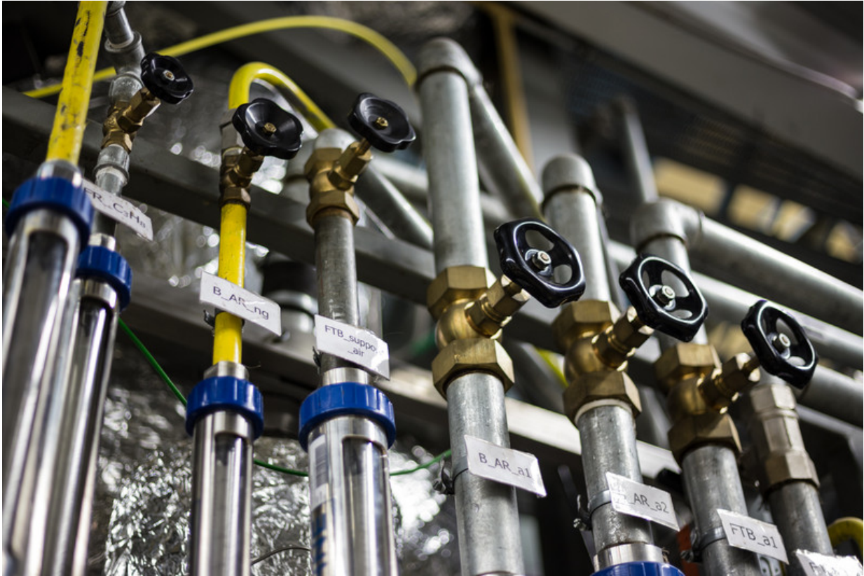
CLC-facility at TU Wien.