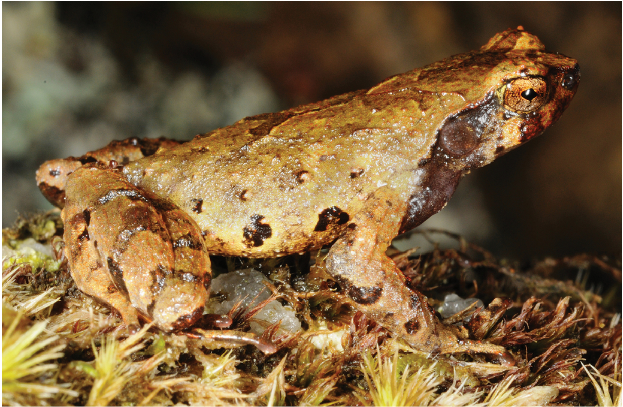
The newly discovered Elfin mountain toad ( Ophryophryne elfina ) is in its natural habitat.