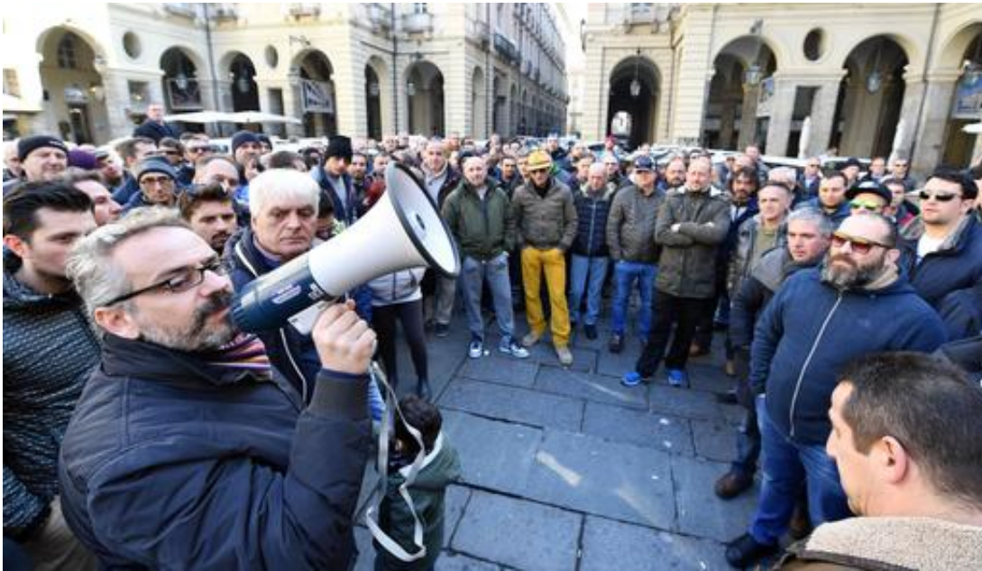
A taxi driver speaks to his colleagues gathered in downtown Turin, northern Italy, during a protest against a government proposed bill on transportation that they fear would endanger their business by favoring American worldwide online transportation network company Uber, Thursday, Feb. 16, 2017.