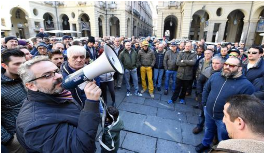
A taxi driver speaks to his colleagues gathered in downtown Turin, northern Italy, during a protest against a government proposed bill on transportation that they fear would endanger their business by favoring American worldwide online transportation network company Uber, Thursday, Feb. 16, 2017.